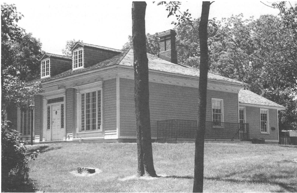
FIGURE 1. Regency cottage of the 1830s. Associations with famous people are not necessary to the survival of old buildings.