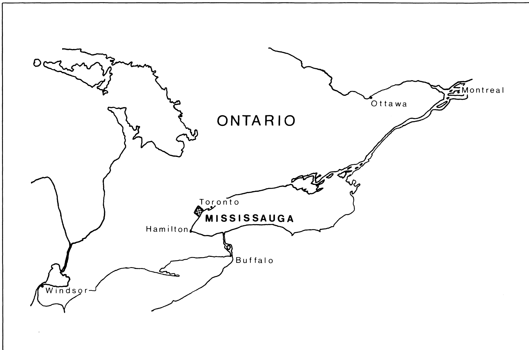
MAP 1. Mississauga in relation to Toronto.