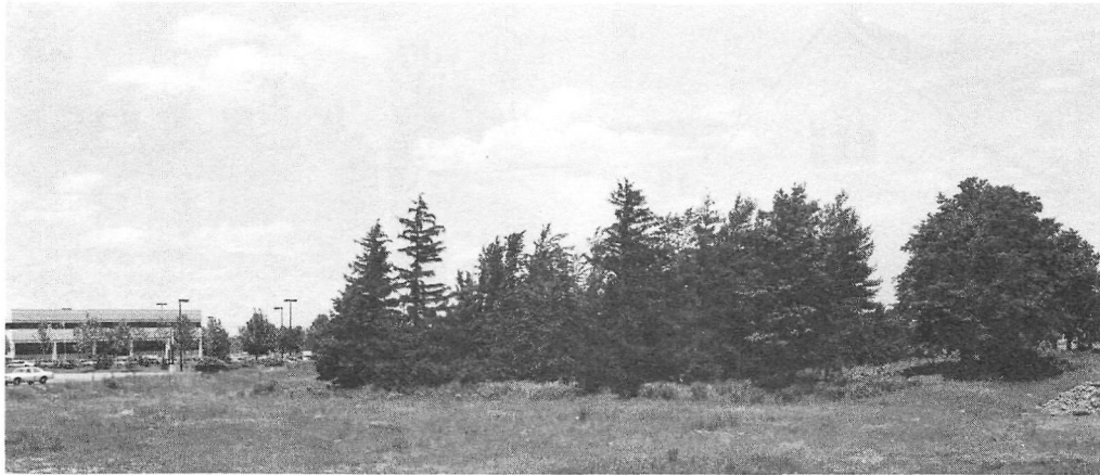
FIGURE 4. Consciously retained farmstead remains. A simple label is adequate to inform a new generation of users from nearby office buildings.