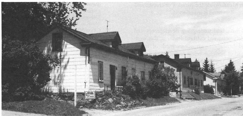
FIGURE 8. Roadside rental rowhousing, a five minute walk from the company's woollen mill. Social meaning is signalled by ordinary buildings.

lage occupies less than 100 acres on the banks of the Credit River, surrounded by floodplain and greenbelt, and is also a secondary (neighbourhood) planning district in the Official Plan (Figure 9). Two pieces of legislation have meshed in an unprecedented instance of site management in which the ambience of the village is preserved. Some structures are specifically designated, but all features, including a supporting cast of trees, culverts, and vacant lots, are recognized as contributing to a whole which is greater than the sum of the parts. Ambience is a specifically cultural attribute, reaching