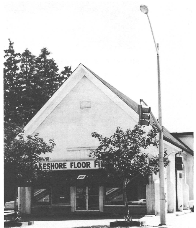
FIGURE 3. Converted church. Altered buildings exhibit resilience, not submission, amid change.

other agricultural uses of the city's territory, therefore, demand cues other than the structures, which announced the past in the present simply by being there. The lilacs, windbreak, and other plantings at a protected farmstead site will only be meaningful for future office workers enjoying a summer lunch hour in the locale if a label or sign is provided (Figure 4). The context of such areas is just too blurred, and