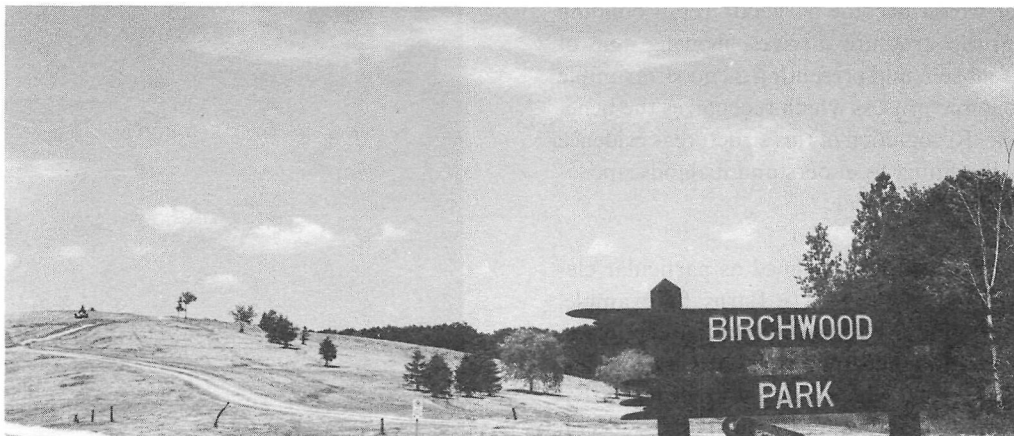
FIGURE 6. Ash heap at Fly Ash Park, now renamed Birchwood Park. The weedy mill race and ash heap are subtle reminders of past and current waste management procedures.