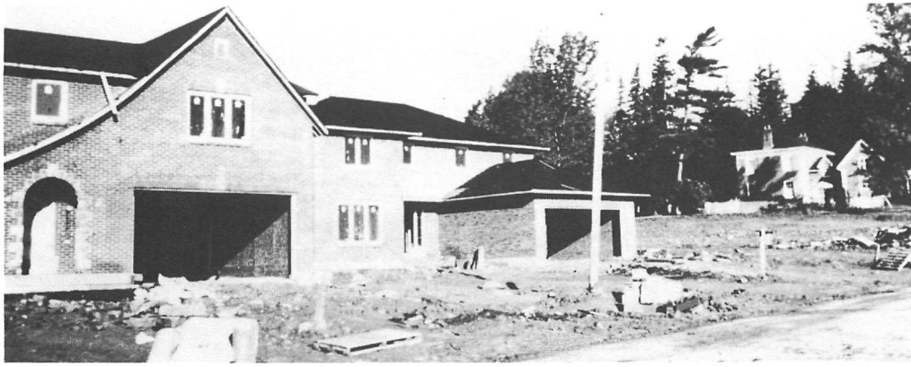
FIGURE 2. Adjacent 1870s and 1970s dwellings. Old age and youth are enhanced by each other's presence.