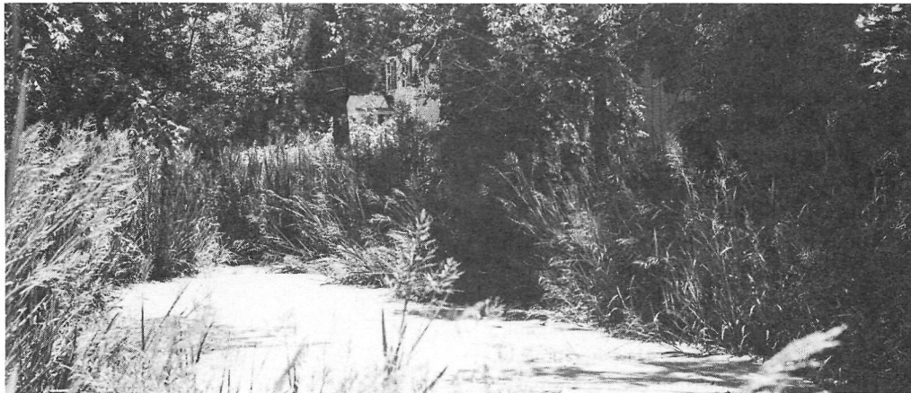
FIGURE 5. Weedy mill race.