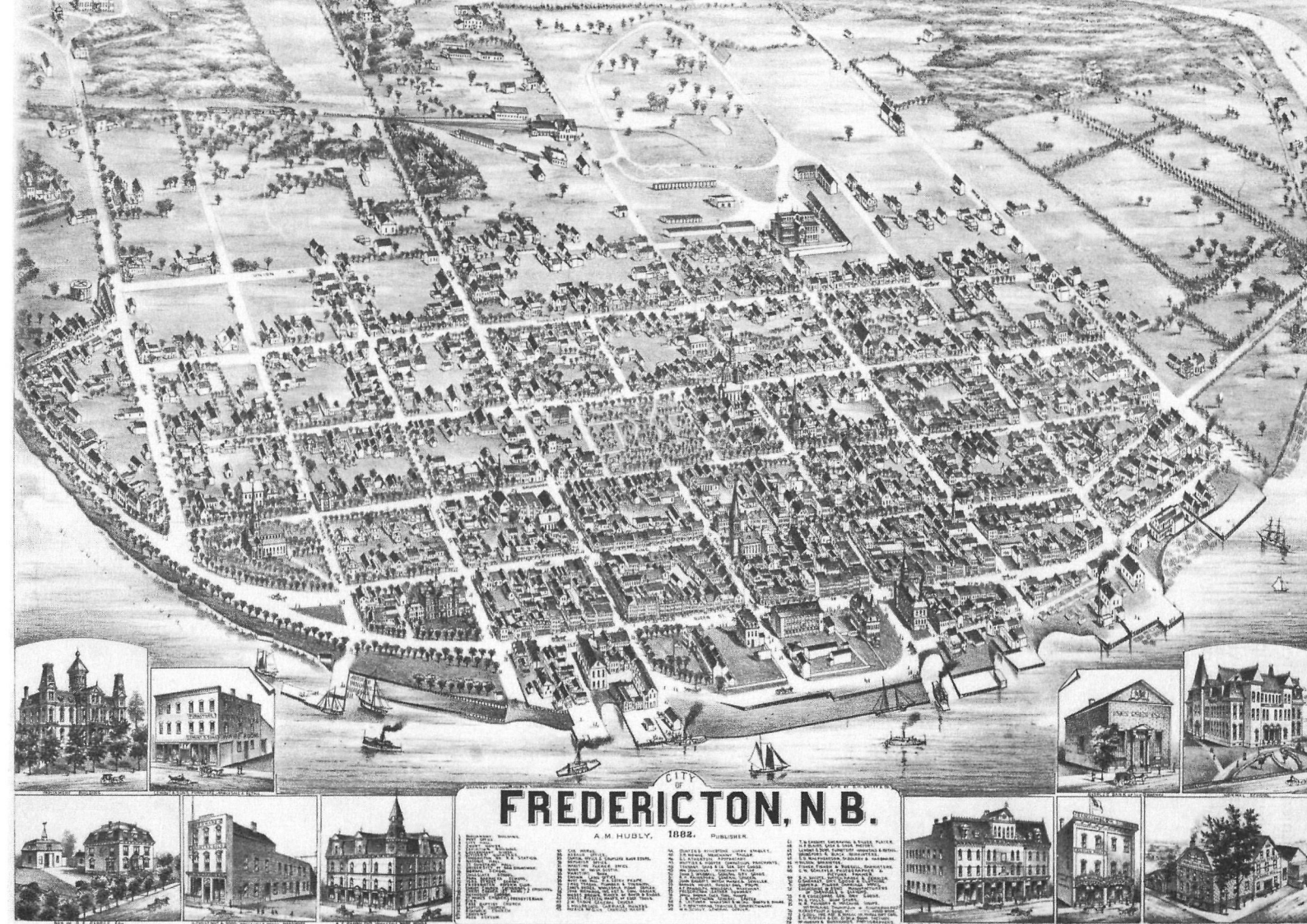
Bird's-eye view of Fredericton, New Brunswick, 1882.

Urban History Review/Revue d'histoire urbaine