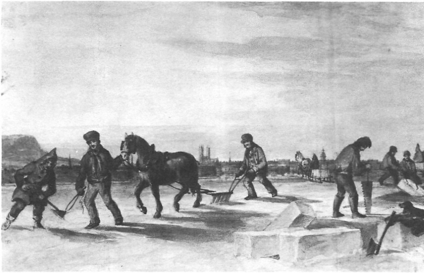
PICTURE 7: James Duncan. Ice Cutting on the St. Lawrence at Montreal . (Royal Ontario Museum, Toronto. Neg. No. 73CAN362. Cat No. 950.66.1.) Cutting and hauling ice from the river was another common theme of 19th century artists.

Duncan's production of city art for the commercial market was varied, including depictions of various newsworthy incidents (the funeral of General D'Urbain, a fire which destroyed the Hayes mansion, the Gavazzi riot); picturesque watercolour cityscapes of Montreal from the mountain and river; portraits of stereotypical tuqued and pipe-smoking Canadiens in Bonsecours market (while Krieghoff's Quebecers were usually rural people, Duncan's were city-dwellers); and a view of middle class Montrealers — members of a local sleighing club — at play (among anglophone burghers and tourists, sleighing pictures were quite popular). The illustrations commissioned for Hochelaga Depicta , on the other hand, are precise architectural drawings of important local buildings (like Short's and Cockburn's work in Quebec, they are valuable historical documents 12 ).