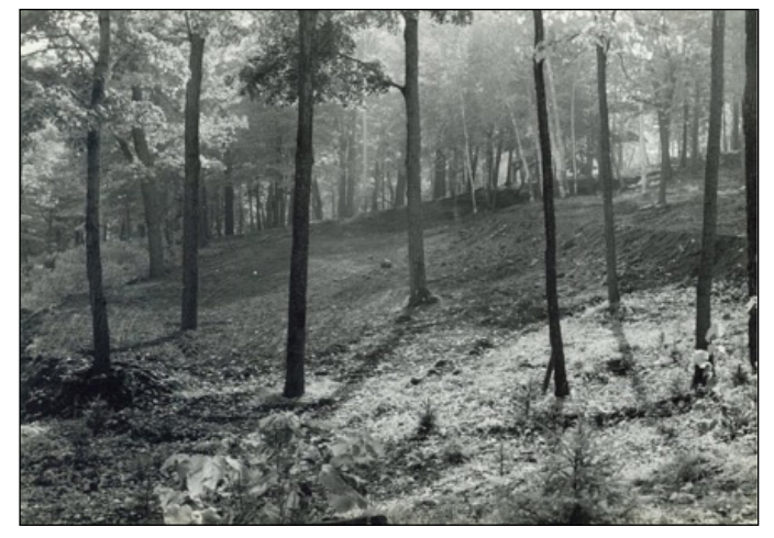
Figure 5. Ground view of Mount Royal after the Morality Cuts in autumn 1960; notice the sparse trees and nearly non-existent underbrush.

down a birch if its space would mean that an oak could breathe and survive. Lacking vegetation, most importantly trees and undergrowth, erosion worsened the condition of the Mountain, creating a vicious cycle of soil erosion and windthrow-less vegetation meant more soil erosion and therefore weaker plants (figure 6). The systematic elimination of the underbrush accentuated these issues and effectively fashioned Mount Royal Park's "bald" image. As one opinion piece pointed out in 1959, "Moussorgski n'aurait jamais imaginé que sa musique prendrait une telle actualité à des milliers de milles de l'Oural!"78 According to the author, Night on Bald Mountain by Russian composer Modest Moussorgsky reflected the ecological and metaphysical state of Mount Royal Park at that time. The unintended result revealed the intricate relationship between modernist ideals and the natural environment; "the administrators' forest" increasingly made the park an artificial construction and demonstrated the irony of human intervention in the park.79