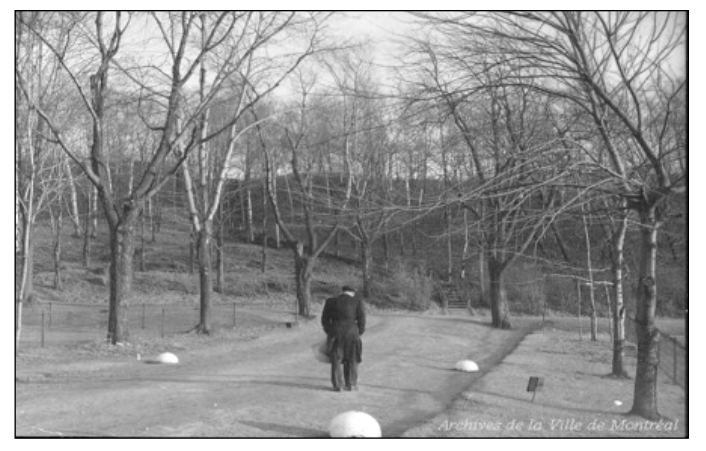
Figure 3. This snapshot was part of a photographic report produced on 18 November 1953, Parc du Mt Royal: Différents paysages. The report depicts various users and aspects of the park, notably hikers, squirrels, and patrons in the chalet's restaurant.

people who helped the police department catch "dangerous criminals" through a system of honorary police membership. By inciting citizens to partake in vigilantism and capture criminals, the city was not only fabricating a proactive policing stance, but more importantly, elaborating a greater distinction between the Same and the unfamiliar Other.<sup>30</sup> Regardless, these preliminary tactics did not satisfy individuals who devotedly sought a safer, cleaner, and more tranquil park.