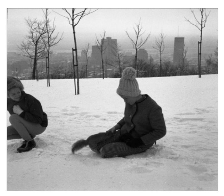
Figure 8. Deciduous trees in the background illustrate the abundance of newly planted Norway maples on Mount Royal on 26 January 1965.

on St-Joseph Boulevard and Pie IX Boulevard had supplied earth fill for the Mountain, ensuring soil supplies for planting and growing areas in the park to make it "proper for nicer-looking trees"<sup>104</sup>—a step away from the transitory resinous trees used to rehabilitate the park. With this soil supply the park could therefore enter a phase of rehabilitation and "beautification" by planting more aesthetically impressive species. Montreal planted more trees than any city in the world in 1960.<sup>105</sup> By 1964 the forestry division began planting wide-ranging types of trees, Norway maples and silver maples, pines, spruce, oak, ash, and elm trees, for a total of 8,500 that year.<sup>106</sup>