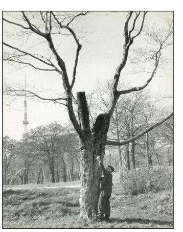
Figure 4. An employee of the city's forestry division analyzes the decrepit state of a tree in autumn 1960. Trees in such a state were numerous at the time in Mount Royal Park.

Nevertheless, the MPPA's comment reveals that they did not wholly reject plans for Mount Royal. Indeed, the Jungle aside, the ecology of Mount Royal Park had been progressively deteriorating. As sources reveal, little attention was given to the park's ecological well-being in the 1940s and 1950s. As Jean-Joseph Dumont, superintendent of the Montreal Parks Department's Forestry Division, stated in