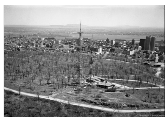
Figure 6. View of Mount Royal's denuded summit following the Morality Cuts.

As the Jungle was cleared, the city could state that their moralist agenda, especially morality in public spaces, had literally reached its summit, effectively demonstrating the limitlessness of morality—going "above and beyond" any height of the city, surpassing the natural environment.<sup>81</sup> For the parks department,