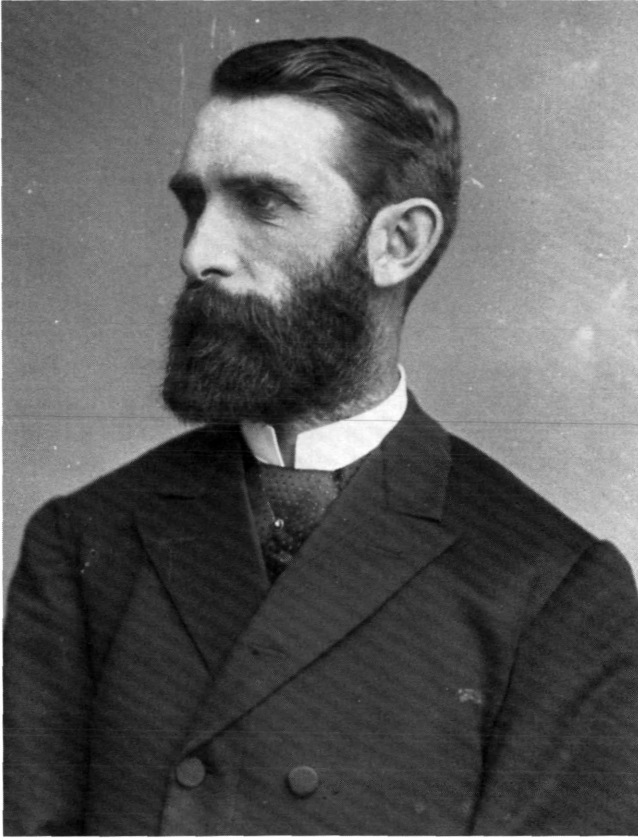
Figure One: Josiah Wood, MP, 1883

tions totalling $50,000 he was by far the railway's largest backer. 63