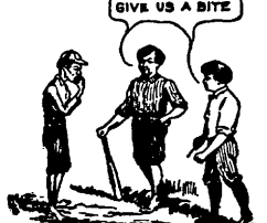
PUTTING FOOD, MONEY, PENCILS ETC. INTO THE MOUTH AFTER A CONSUMPTIVE HAS POISONED THEM WITH HIS SPIT.