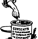
OR PUTS IT INTO A DISINFECTANT,—