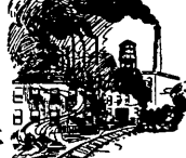
SMOKE AND DUST.