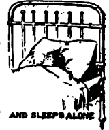
AND SLEEPS ALONE