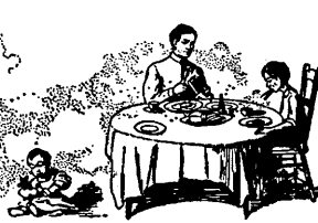
THE GERMS MAY ENTER THE BODIES OF CHILDREN PLAYING ON THE FLOOR, THROUGH SORES OR WOUNDS.