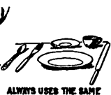
ALWAYS USES THE SAME DISHES AND BOILS THEM IN WATER BEFORE WASHING WITH OTHER DISHES,—