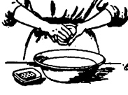
WASHES HER HANDS BEFORE AND AFTER EATING—