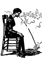
CONSUMPTIVE SPITTING ON FLOOR. FLIES FEEDING ON IT, CARRY THE GERMS OF THE DISEASE TO FOOD.