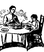
OTHERS MAY GET THE DISEASE BY BREATHING OR SWALLOWING THE GERMS. SPRAY GIVEN OFF IN SNEEZING OR COUGHING CONTAINS GERMS IN A MOIST AND ACTIVE STATE.