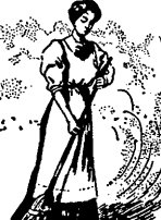
THE SPIT DRIES AND CARELESS SWEEPING, DUSTING OR DRAUGHTS CAUSE THE GERMS TO FLOAT IN THE AIR.