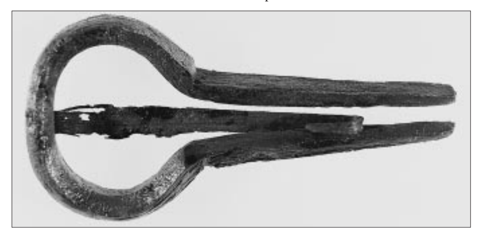
Figure One Jew's Harp

Source: Excavated at Louisbourg. Date range of archaeological context: 1719-68. 6.8 cm. long. Artifact #16L.92N19.9.