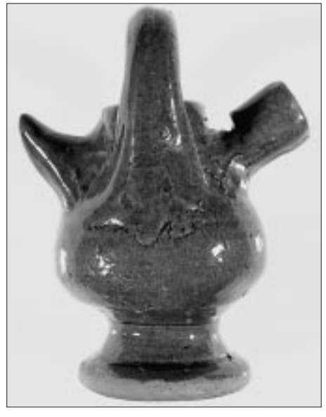
Figure Two Reproduction of a Green-Glazed Coarse Earthenware Water Whistle from the Saintonge Region in Southern France

Source: The original water whistle was excavated at Louisbourg. Date range of archaeological context: 1716-17. 10 cm. high. Artifact #4L.50M14.1.