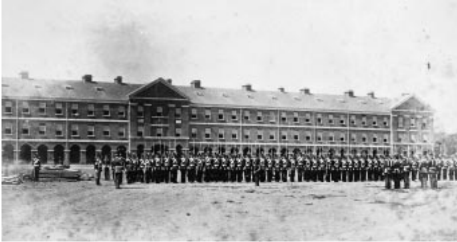
Figure Three The Men's Quarters, Wellington Barracks, East Face, in 1863, Soon After its Completion, Showing the Colonnade