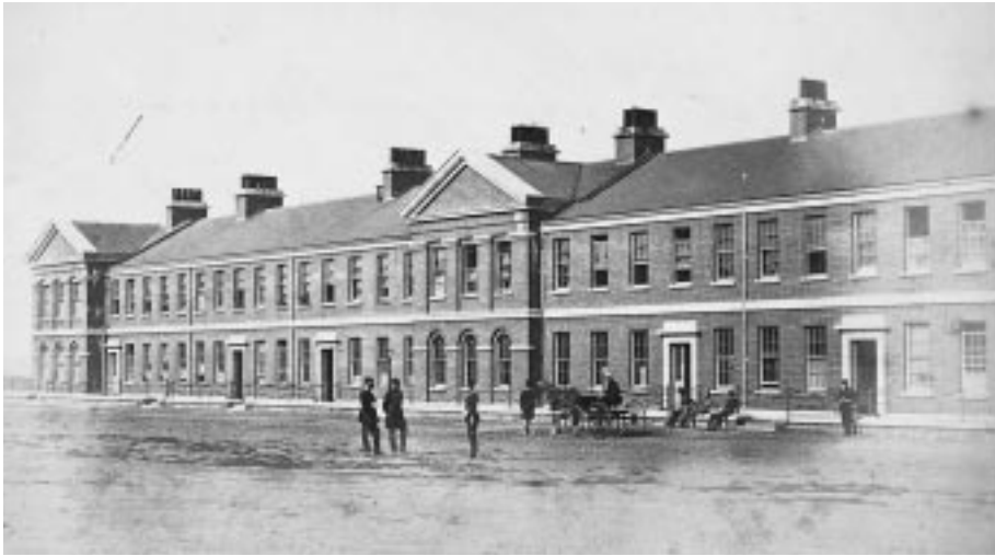
Figure Two The Officers' Quarters, Wellington Barracks, West Face, in 1863, Soon After its Completion