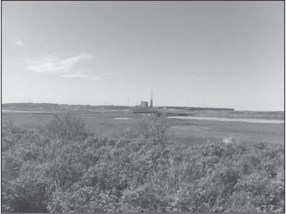
Figure 4: Lingan Generating Station near New Waterford, Cape Breton (2013). Nova Scotia Power's largest generating station, originally solely coal-fired but now with wind turbines.