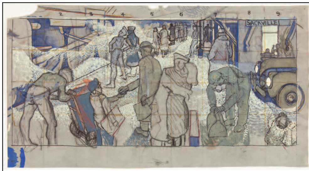
Figure 3: Alex Colville, preparatory drawing for Sackville train station mural (1942).