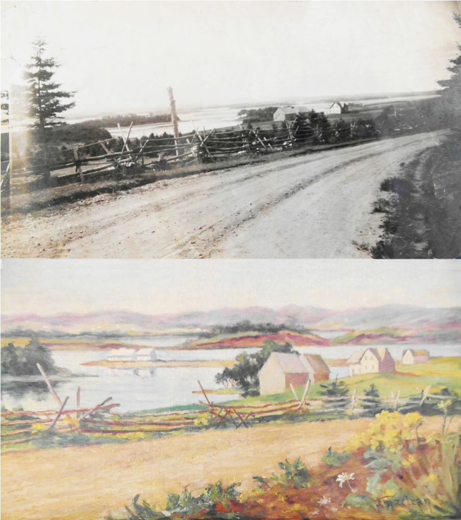
Figure 6 – A visual and artistic representation of Scottish settlement patterns and their legacy on the Nova Scotia landscape: Big Island looking toward Savage Point, as photographed and painted by Jean MacLean, c. 1920.