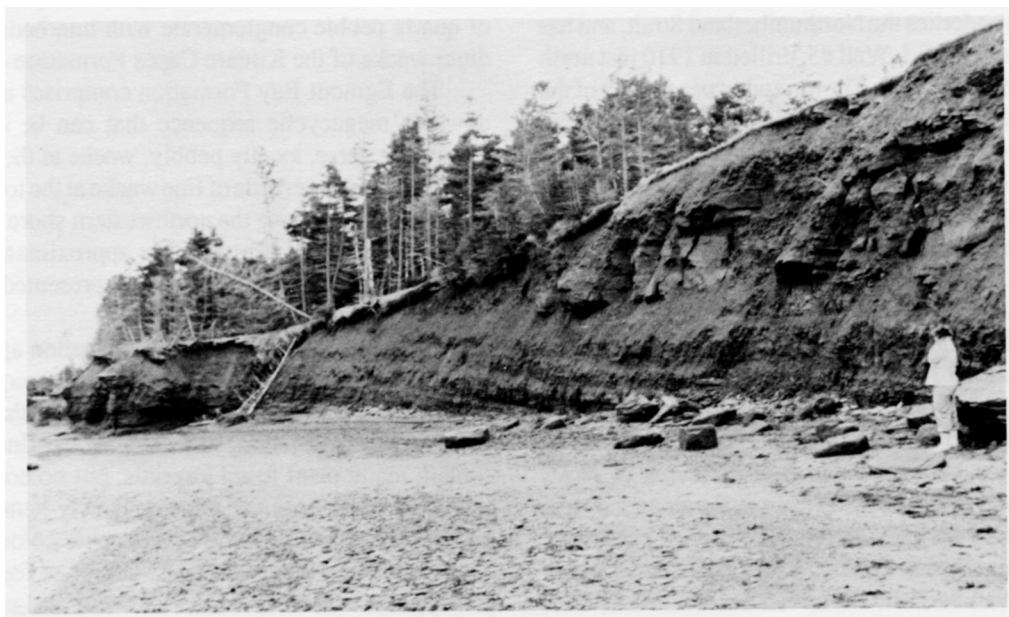
Fig. 3. Slightly tilted fining-upward channel-overbank sequences of the Kildare Capes Formation, at Fort Amherst, Hillsborough Bay near Charlottetown, Prince Edward Island (standing person for scale).

Spore data obtained from purplish grey strata near the surface in Earncliffe Well # 1 at Gallas Point similarly indicate an early Permian (Sakmarian) age (Barss et al. , 1963; Hacquabard, 1972) for the strata assigned here to the Kildare Capes Formation. This early Permian age is further supported by the presence of vertebrate fossils obtained from a number of localities around Hillsborough Bay (Langston, 1963) and by a recent find at Prim Point of tetrapod trackways in upper Kildare Capes strata interpreted to represent Amplisauropus latus Gilmoreichnus kablikae and possibly Ichniotherium willsi indicating a similar early Permian age (Mossman and Place, 1989). On tenuous evidence Langston (1963, p. 29) suggested that vertebrate fossiliferous beds exposed further west at Seacow Head are