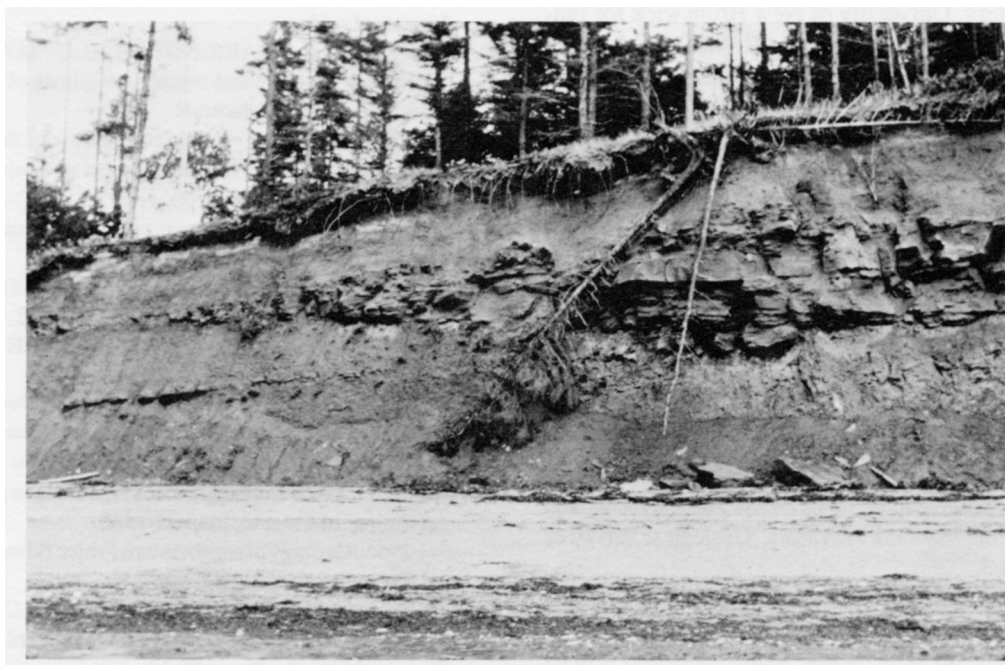
Fig. 4. Small channel and levee-splay sequence in floodplain strata of the Kildare Capes Formation at Tea Hill, Hillsborough Bay near Charlottetown, Prince Edward Island (trees for scale).

(4) It is further proposed here to subdivide the Northumberland Strait Supergroup into two Groups: the Pictou Group below and the Prince Edward Island Group above. The Pictou Group continues to incorporate all Westphalian C, D and Stephanian aged grey and redbeds, and coal measures of New Brunswick and Nova Scotia which have historically been assigned to it. The Prince Edward Island Group is a newly proposed lithostratigraphic unit to include all of the redbeds of Prince Edward Island. The contact between the Pictou and Prince Edward Island groups being essentially based on colour, is gradational and time transgressive across the Stephanian Stage. The age of the group is from Stephanian to late Early Permian.