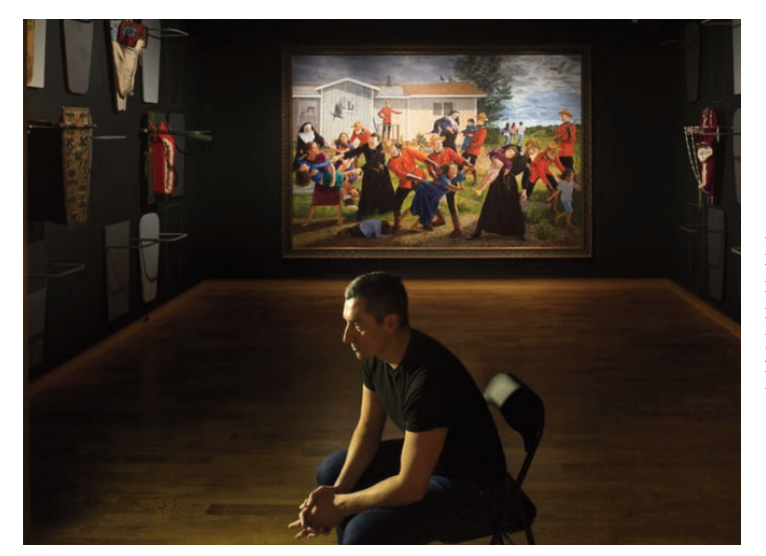
Figure 1: Installation Shot, from Murray Whyte. "Kent Monkman Fills in the Blanks in Canadian History," Toronto Star, January 22, 2017.

Perhaps the most powerful Indigenous art exhibition of 2017 to address ethical relationships to land was Shame and Prejudice: A Story of Resilience , a travelling exhibition of art by two-spirited Cree artist Kent Monkman, first mounted at the Art Museum at the University of Toronto in 2017 and then installed at the Glenbow in Calgary, before moving to other venues in 2018 through 2020.<sup>38</sup> Shame and Prejudice [fig. 1] takes on colonial settlement of this land, countering messages in late nineteenth and early twentieth-century landscapes on display in Canadian art museums through a series of contemporary paintings, installations, and performance-artworks that taunt western artistic tropes through the witnessing and performative presence of his alter ego Miss Chief Eagle Testickle. This exhibition disarms viewers with thoughtful provocations about established ways of seeing the land and, as importantly, ways of seeing the nation.