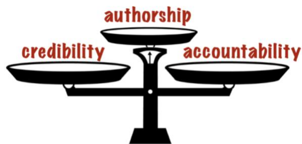
Figure 1. Authorship equation

Researchers should familiarize themselves with proper authorship practices in order to protect their copyrights from research fraud. Moreover, researchers should be aware of the authorship practices within their own disciplines and should always abide by the requirements stipulated by a prospective publishing journal. As some journals require processing and/or publication fees, financial issues should be settled and agreed upon early in the research process to avert subsequent disputes. The Committee on Publication Ethics (COPE) has a guide to help researchers navigate authorship issues (6). Detailed management of authorship disputes is beyond the scope of this article.