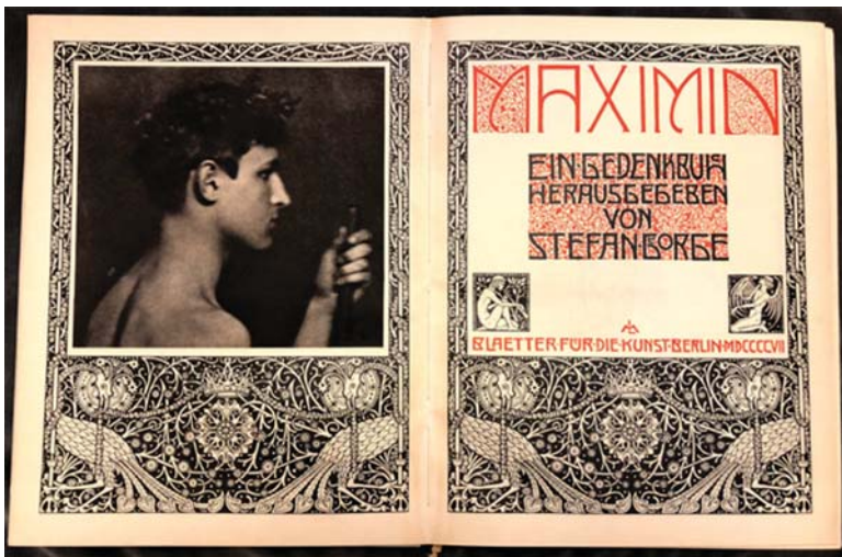
Title page of Maximin. Ein Gedenkbuch (A Memorial Book), by Stefan George (1907).