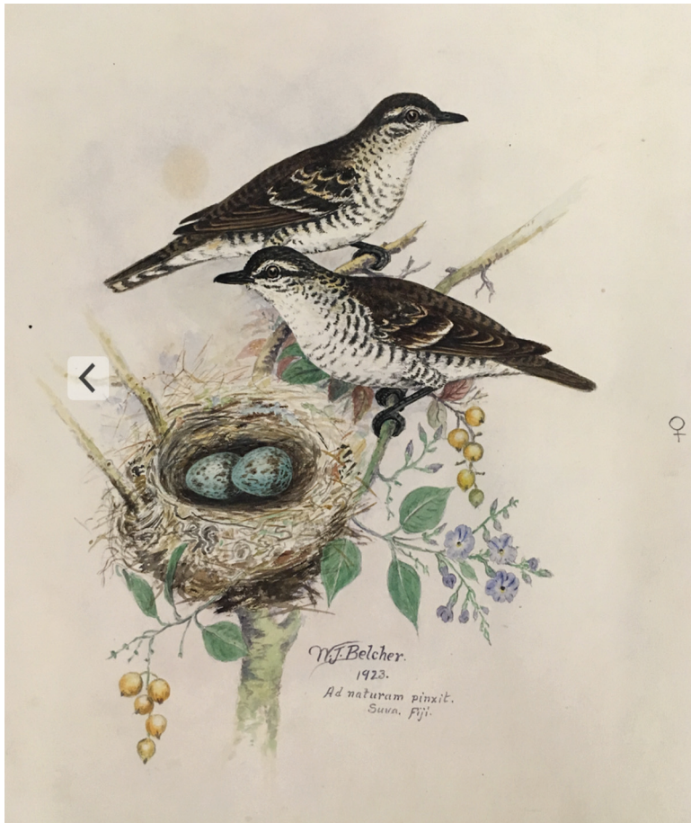
Figure 1. Lalage maculosa woodi , by W.J. Belcher, 1923.

Press to form the basis of an illustrated version of Wait's work. 6 The result was The Coloured Plates of the Birds of Ceylon , published in four