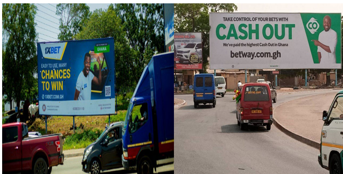
Figure 1. Two examples of betting billboards on the streets of Accra.