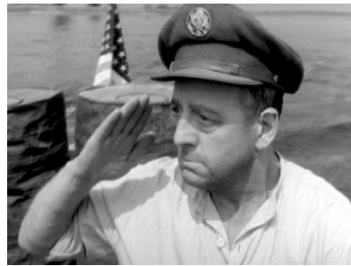
Karbid und Sauerampfer (Beyer, 1963)