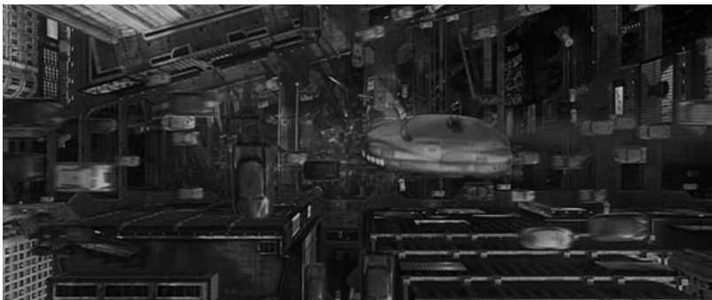
Figure 3: Korben Dallas's yellow cab begins its vertical free fall down through the layers of traffic.

One of the basic techniques for producing special effects is the blue screen or something like it, which allows filmmakers to introduce different layers into the image; or, as Digital Domain puts it, elements into the shot. Consider, for instance, the use of mobile backgrounds to produce the sensation of a travelling car: the car is still, while the landscape streams past the windows. Such techniques rely on and reinforce the horizontality of the car, because the effect works best when the view from the windows is lateral. Something analogous happens with digital effects in which different elements are added to the shot. The different layers of the image have to be carefully composited to ensure that the world of the image appears continuous. Even when there is motion in depth or along the diagonal, the actual techniques of layering and compositing impart a flatness and