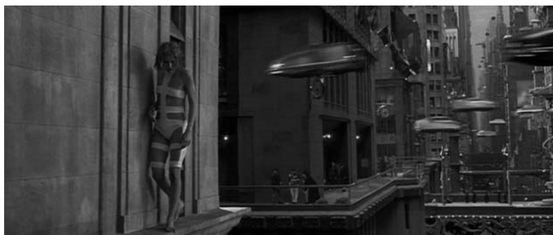
Figure 1: A view from The Fifth Element across New York in 2263 from the viewing position of Leeloo shows the orderly horizontal patterns of traffic circulation.

fashion, and in stacked layers, which implies the presence of streets, yet these streets are not solid or visible. They are immaterial: although there is nothing there, this is not an absence of materiality; there are material effects that assure smooth circulation. But the streets do not allow for pedestrians. Leeloo's escape is cut short at the "streets."