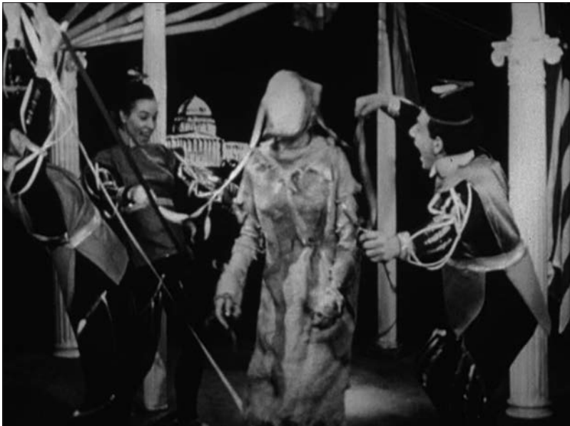
Figure 3b: Frame enlargement from The Investigators (1948).