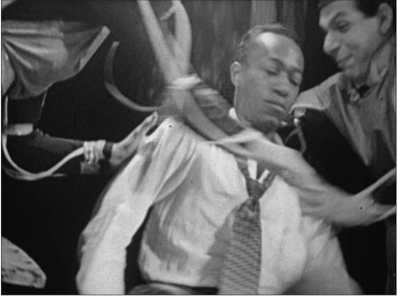
Figure 3c: Frame enlargement from The Investigators (1948).