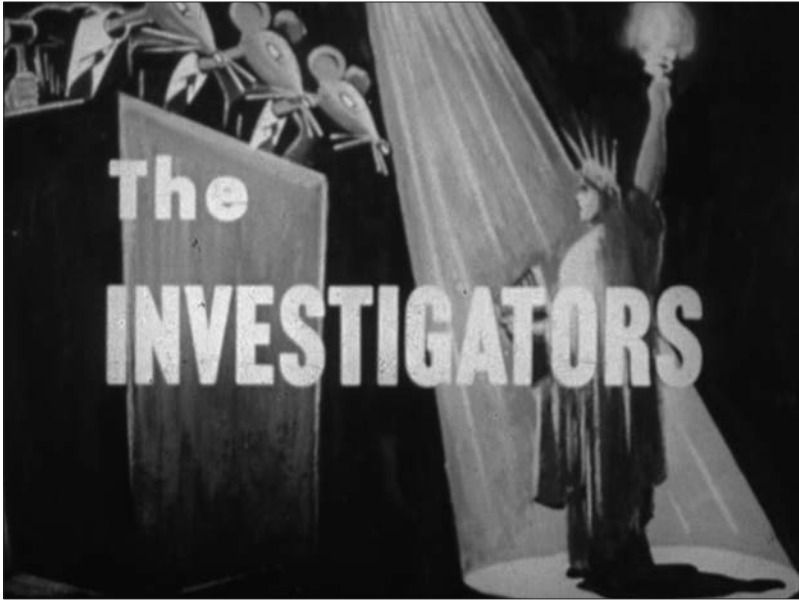
Figure 3a: Frame enlargement from The Investigators (1948).