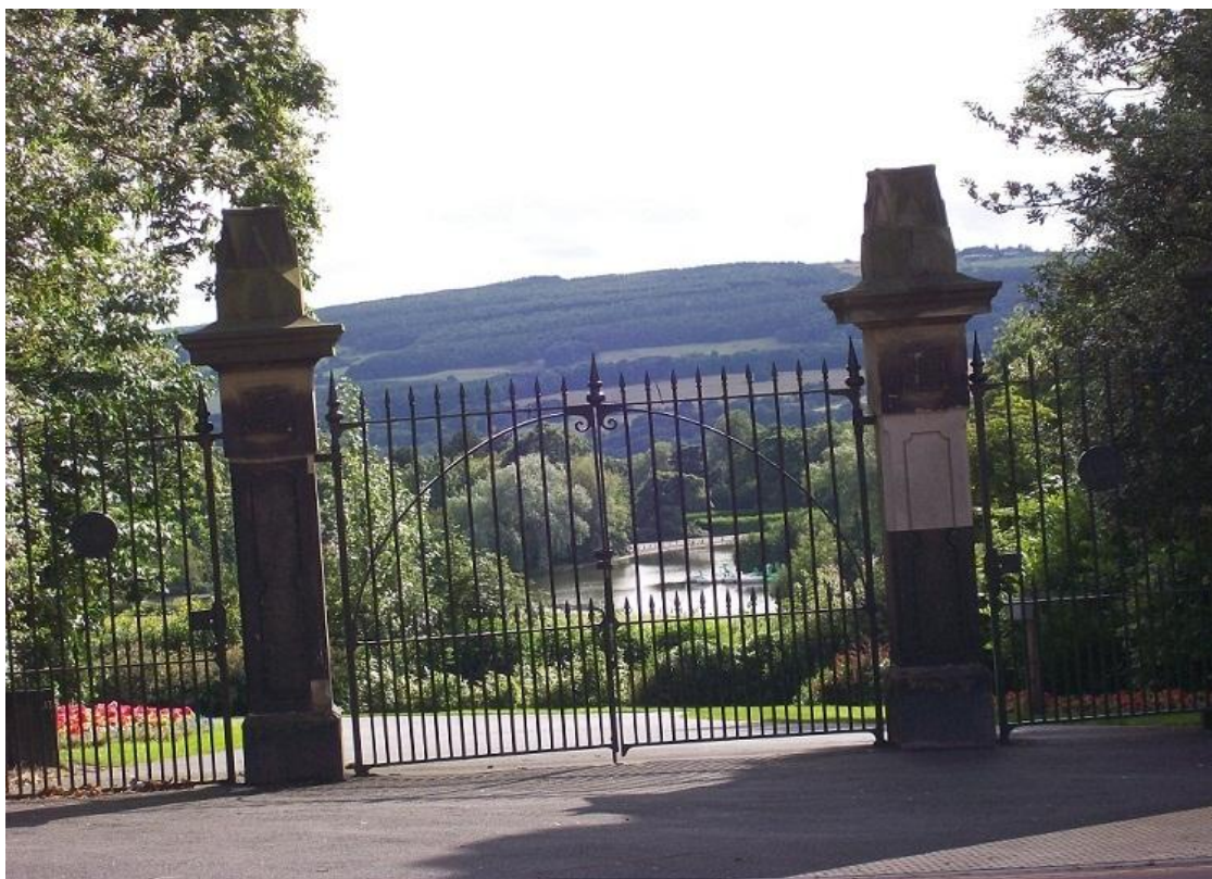
Figure 12 Saltwell Park, Gateshead

those pausing for a drink as they contemplate public transport back to the start of this journey are confronted with a painted depiction of the Angel bidding welcome to a public house...thus it stands as a symbol for the immediate area (Gateshead not Newcastle), the region as a whole (the North not the South), transport, alcoholic drink, retailing, estate agency – the Agent of the North, lunch for office workers – implausibly enough, the Bagel of the North - and wherever else the imagery leads. The symbol is both inclusive and exclusive, depending on audience, time and context. The walk between two prominent cultural reference points demonstrated above all that they are only part of – indeed, they are overwhelmed by – the innumerable, and largely unrecognised, cultural reference points in between.