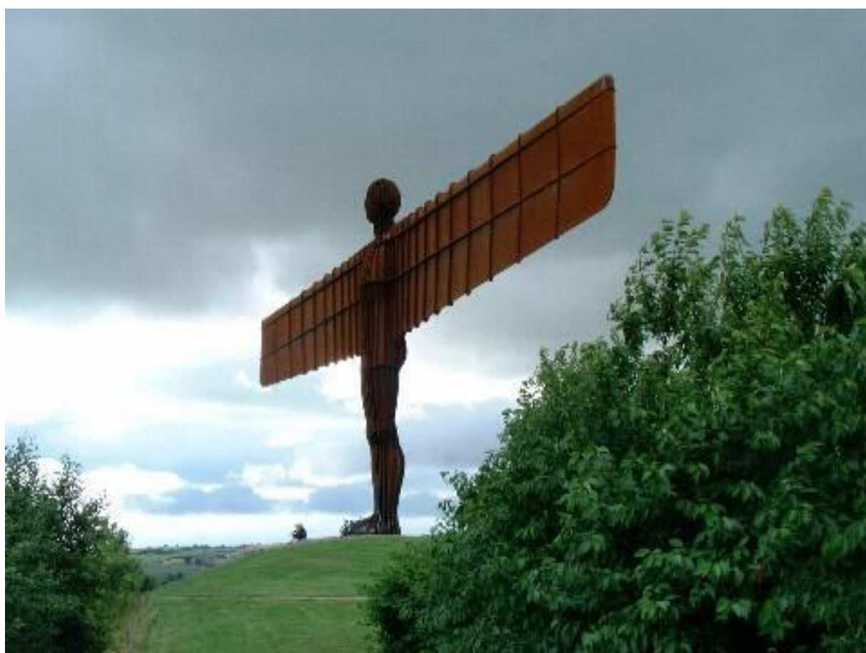
Figure 1 Antony Gormley’s Angel of the North – erected in 1998 and viewed by many as a sign of the regenerated north of England

In the three sections that follow we explore attempts to represent and rebrand northern cities with particular reference to Newcastle-Gateshead. The recently constructed urban image of the northern city and the cultural impression it creates exist alongside residual elements of urban landscapes, economies and cultures. Our enquiry looks in two directions – towards the real and towards the representation, and it attempts to chart the distance between the two. The first section outlines the background to the process: the transformation from industrial to postindustrial city; the political and economic changes associated with this; and the policy contexts that give rise to a policy driven concept of culture. The second section explores the form of urban rebranding and spectacle characterised by the image of party city with a reliance on advertising and consumption and certain forms of cultural participation. The third section involves a series of observations of two areas of Newcastle-Gateshead viewed through the filter of policy presentation, urban rebranding and spectacle. Our findings and conclusion point towards a considerable difference between existing reality in the area of culture and the social and economic fabric of northern cities and representations of the rebranded urban.