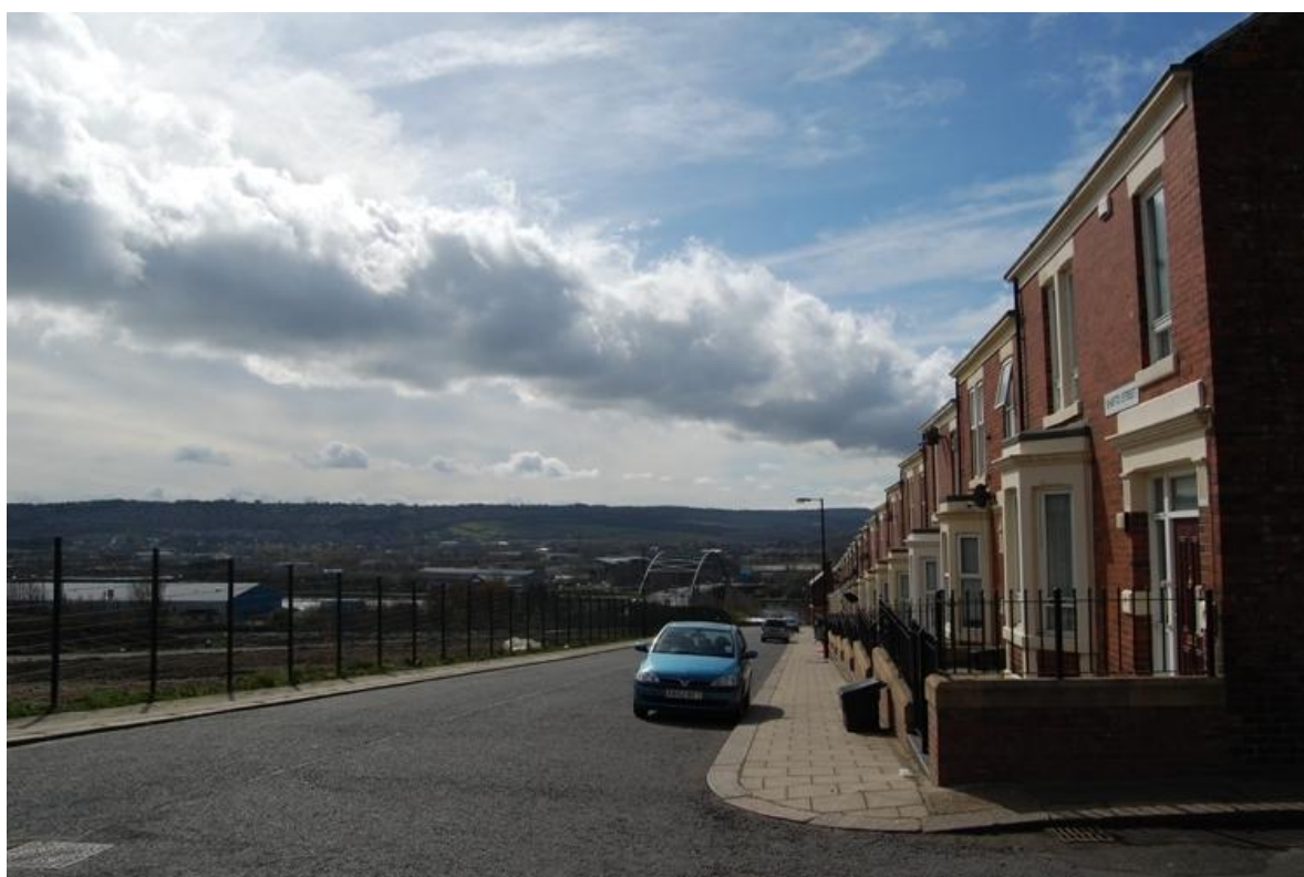
Figure 17 Shaftoe Street, Scotswood

A BKY spokesperson recently described the launch of the Scotswood Urban Renewal Vehicle (SURV) as ‘a major step towards the creation and regeneration of a key Newcastle community’. This begs the question of what remains of the Scotswood community and what can be expected of the future? Part of the community has been displaced never to return, some will return but to a different kind of place and culture; others are living on the periphery of development (Figure 17). Going for Growth was intended to reverse the trend of a dwindling post industrial population. Shafto Street, a terrace of handsome Tyneside houses similar to the one demolished, sits behind newly placed railings on the edge of the development and looks out across the vast building site enclosed by a two and a half metre high fence. 6 The ground is being levelled and prepared for the building programme which is expected to last for 15 years. Work has already slowed because of the discovery of mine shafts from the industrial past.