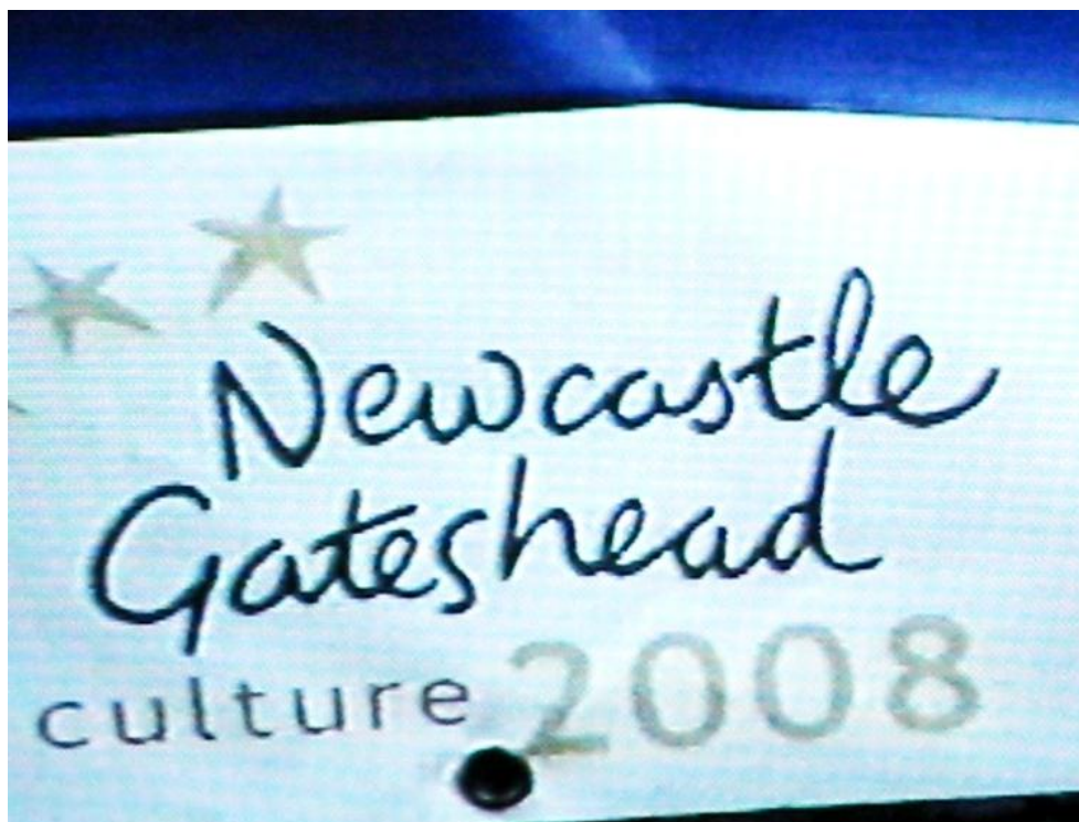
Figures 5 & 6 Newcastle-Gateshead banners - love the buzz & culture 2008