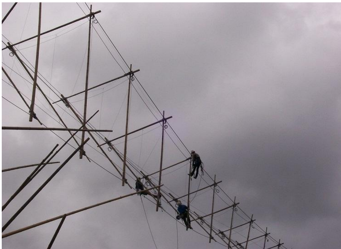
Figure 18 Bamboo bridge arts project spanning the Tyne, by Bambuco

Life is experienced, for most people in Britain's northern cities, as uncertainty, conditioned by the national and regional economic effects of the financial and political crisis. Politics, as it currently moves through most people's lives in the north, is about price fluctuation, job losses, and cuts to health and social services, education and cultural provision. In response to this a more volatile politics of community action, student protest, trades union resistance, and direct street action is gaining ground. This finds its place within a wider global environment in which the struggle for democratic rights and institutions predominate.