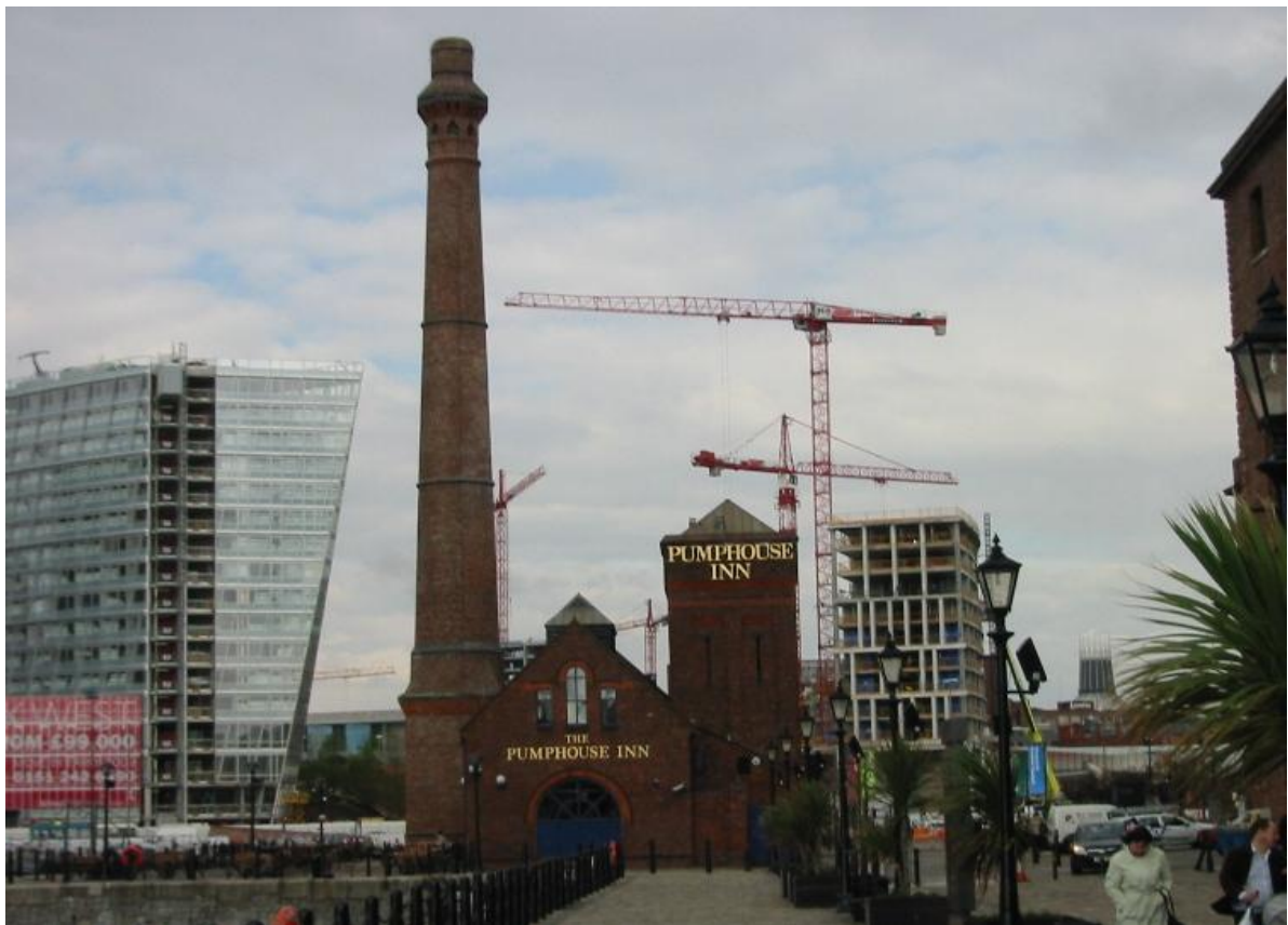
Figure 9 Liverpool regeneration 2007