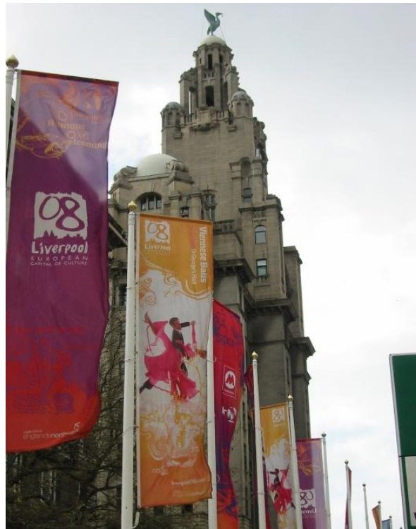
Figure 3 Liverpool's Liver Building with Capital of Culture banners 2008

In the next section we look at the form that city regeneration has taken and the image of urban rebranding, the spectacle of culture based on the party-city concept and a reliance on advertising, consumption and leisure as aspects of culture as a policy product.