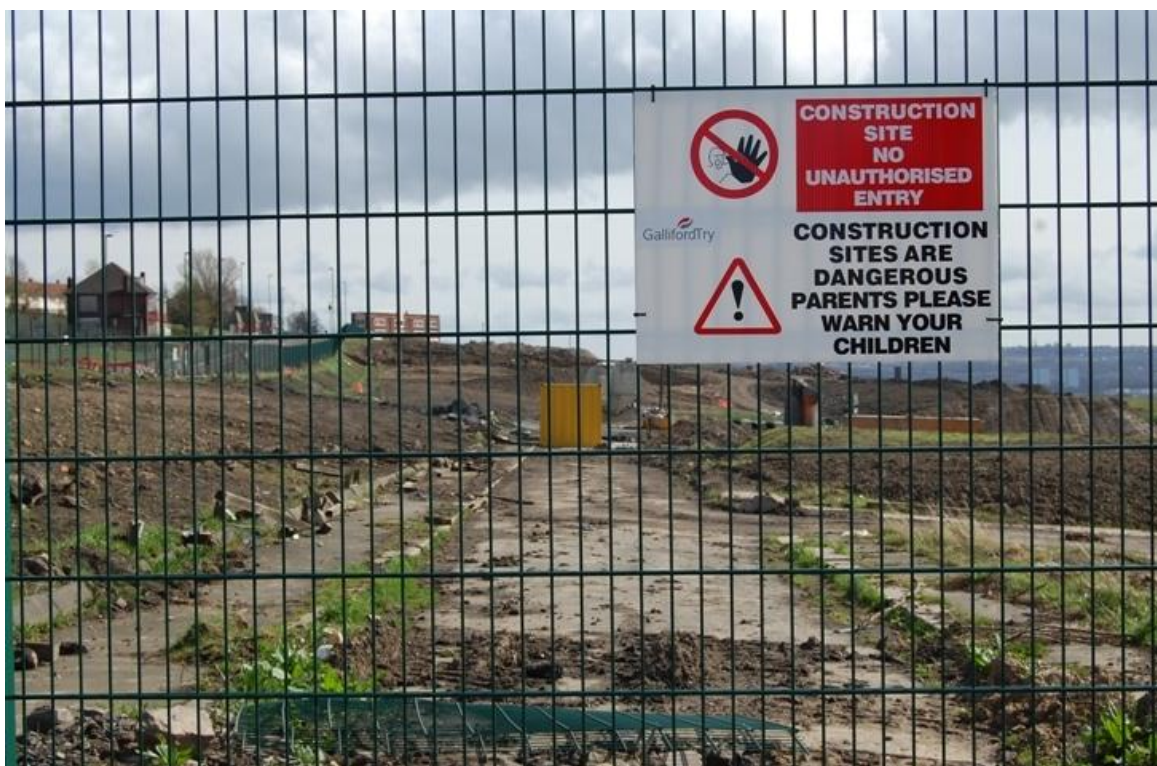
Figures 15 & 16 Demolished Scotswood from east and west