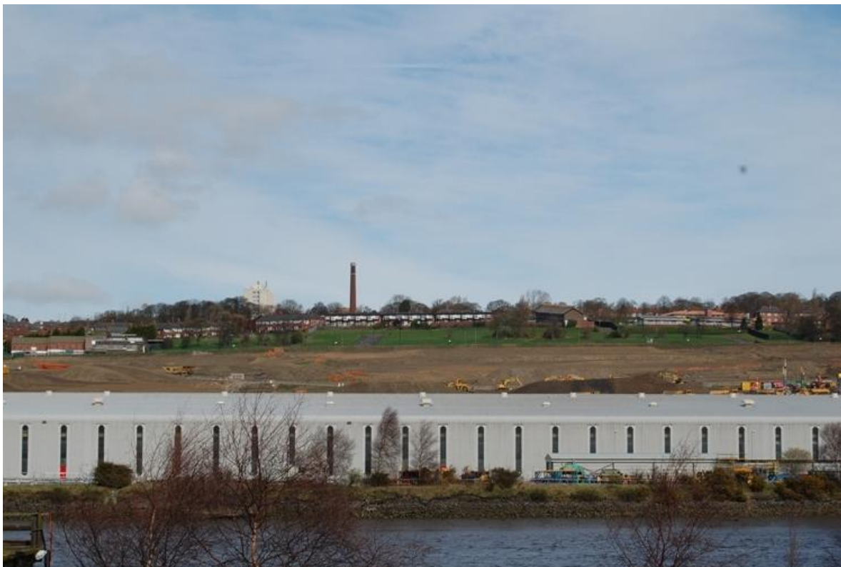
Figure 14 The Armstrong works with Scotswood beyond

The original GfG plans anticipated that 6000 homes would be demolished and these replaced with the building of 20,000 new homes across the city. 5000 of the demolitions were to be in the West End of the city which includes the Scotswood area. This required the displacement of existing lower income populations, moving to vacant local council housing in the city but not necessarily within their own area and the compulsory purchase of private homes. This met with fierce criticism and public opposition when it was announced. Critics argued that it would lead to the fragmentation of long-established communities. The Newcastle Community Alliance was formed from the communities involved demanding the council withdraw its demolition proposals and enter into dialogue, which it did but without providing an alternative. In sharp contrast to the official flags soon to adorn the city centre announcing the council's commitment to culture, the ECOC bid and the city's new, rebranded image, Scotswood was draped in homemade banners declaring 'We shall not be moved' (Guardian, 13 th September, 2000). The Liberal Democrats replaced Labour in the June 2004 council elections and announced that GfG would be scrapped, however 1500 homes had already been demolished and elements of the GfG were included in the Pathfinder plans known as Bridging NewcastleGateshead (BNG).