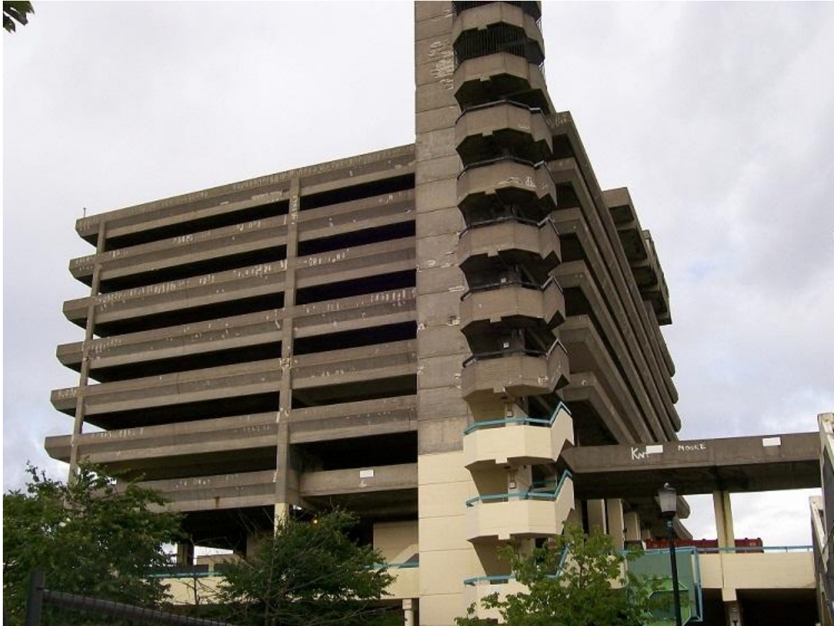
Figure 11 Gateshead's car park

Past the contemporary Civic Centre - the modern political site of local administration - through the terraces and the orthodox Jewish community which has long roots here alongside an urban working class and its schools and Christian churches, and then coming across older embodiments of public culture in the shape of the Central Library, the Shipley Art Gallery, alongside the stone-fronted building of the former Education Offices and its promise of what would once have been called 'betterment' and enlightenment. Then immediately to the delightful prospect of Saltwell Park, its gates firmly locked today as part of a council workers' strike, but a view through the iron bars accentuates the arcadian imagery of this rural idyll, deserted and silent, looking across to the green fells beyond, amidst what was industry and pollution before the disappearance of the old economy (Figure 12).