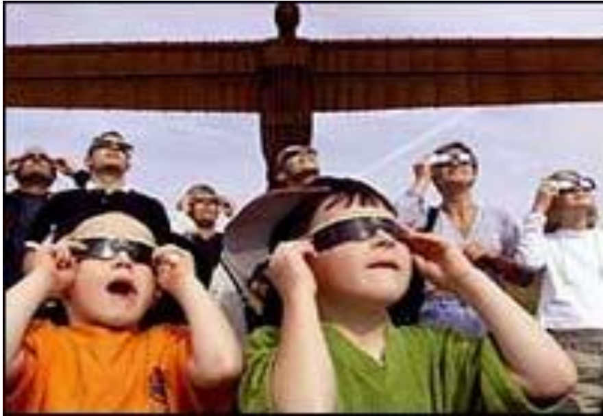
Figure 7 The Angel of the Spectacle