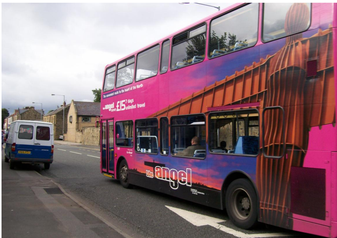
Figure 13 Gateshead bus with Angel