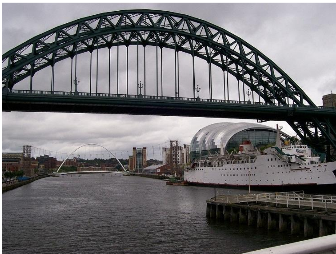
Figure 10 Newcastle's Tyne Bridge, Sage and Baltic

Away to each side, the buildings of the town centre reflect the decline of local retailing as it has been overtaken by other ways of consuming – the Co-operative department store finally closing in recent memory – while some proud, assertive, buildings – ‘1925’ – push themselves shamelessly forward amidst the boarded up shop fronts.