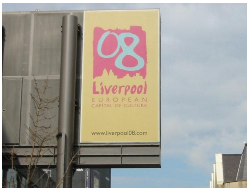
Figure 4 Liverpool celebrating European Capital of Culture 2008