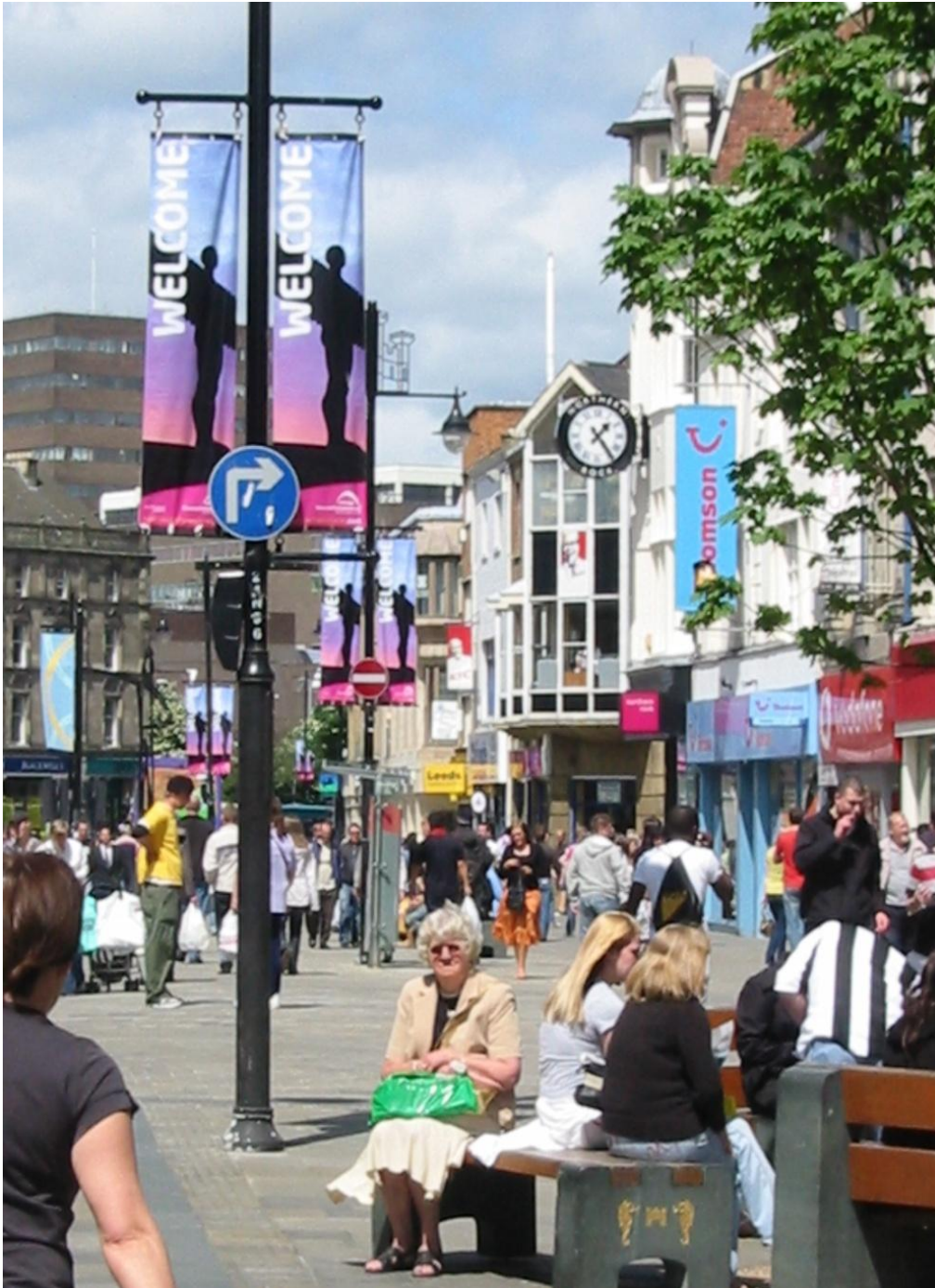
Figure 2 Northumberland St - Newcastle upon Tyne's main shopping street with welcome angel banners