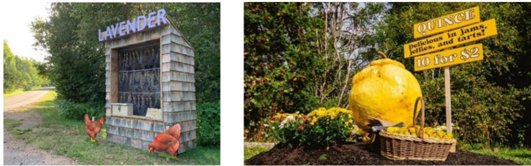
Figure 1: Alexis Bulman's Future Booths, located in rural PEI, feature lavender and quince, both crops that are adaptive to the high temperatures and drought expected on PEI as climate change progresses.

Also in 2021, CreativePEI and The River Clyde Pageant launched Riverworks , a project in which three artists independently created artworks on the topic of ecological transformation. As mentioned above, erosion is a key impact of climate change and a priority area in Epekwitk's climate adaptation plan (Government of Prince Edward Island, 2022). Several shoreline preservation techniques exist, and living shorelines are one such solution. Living shorelines provide a nature-based alternative to more common hard-armouring techniques, using natural materials to reinforce the shoreline without destroying habitats (Howard et al. 2022). Each Riverworks artwork (Figure 2 below) is (or was) located on a different living shoreline in Charlottetown or the neighbouring town of Stratford. Together, the shorelines and artworks present an opportunity for the public to engage with transformations in their communities brought about by climate change.