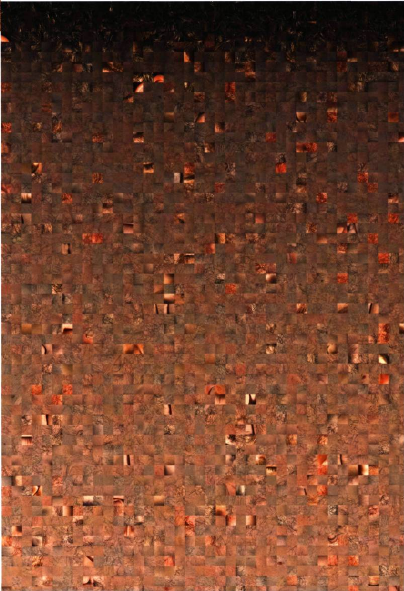
page 24 100 Special Moments digital colour prints variable dimensions 2004