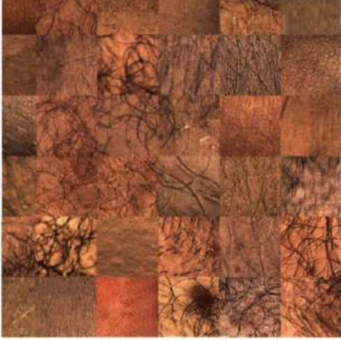
Flayed Figure (detail) Flayed Figure, Male, 3277 1/2 square inches laminated digital colour print 176 x 122 cm 1998/2001