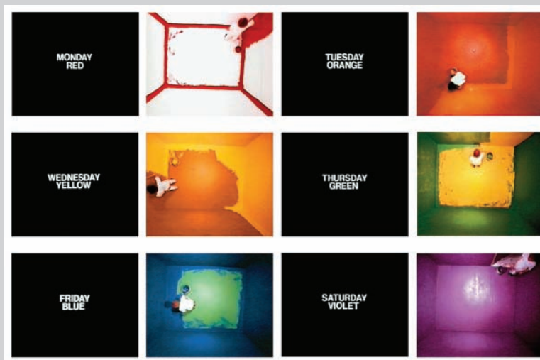
John Baldessari, Six Colorful Inside Jobs , 1977, video stills, 16 mm color film transferred to video, 32 min. and 53 sec., courtesy of the Marian Goodman Gallery, New York and Paris, © John Baldessari