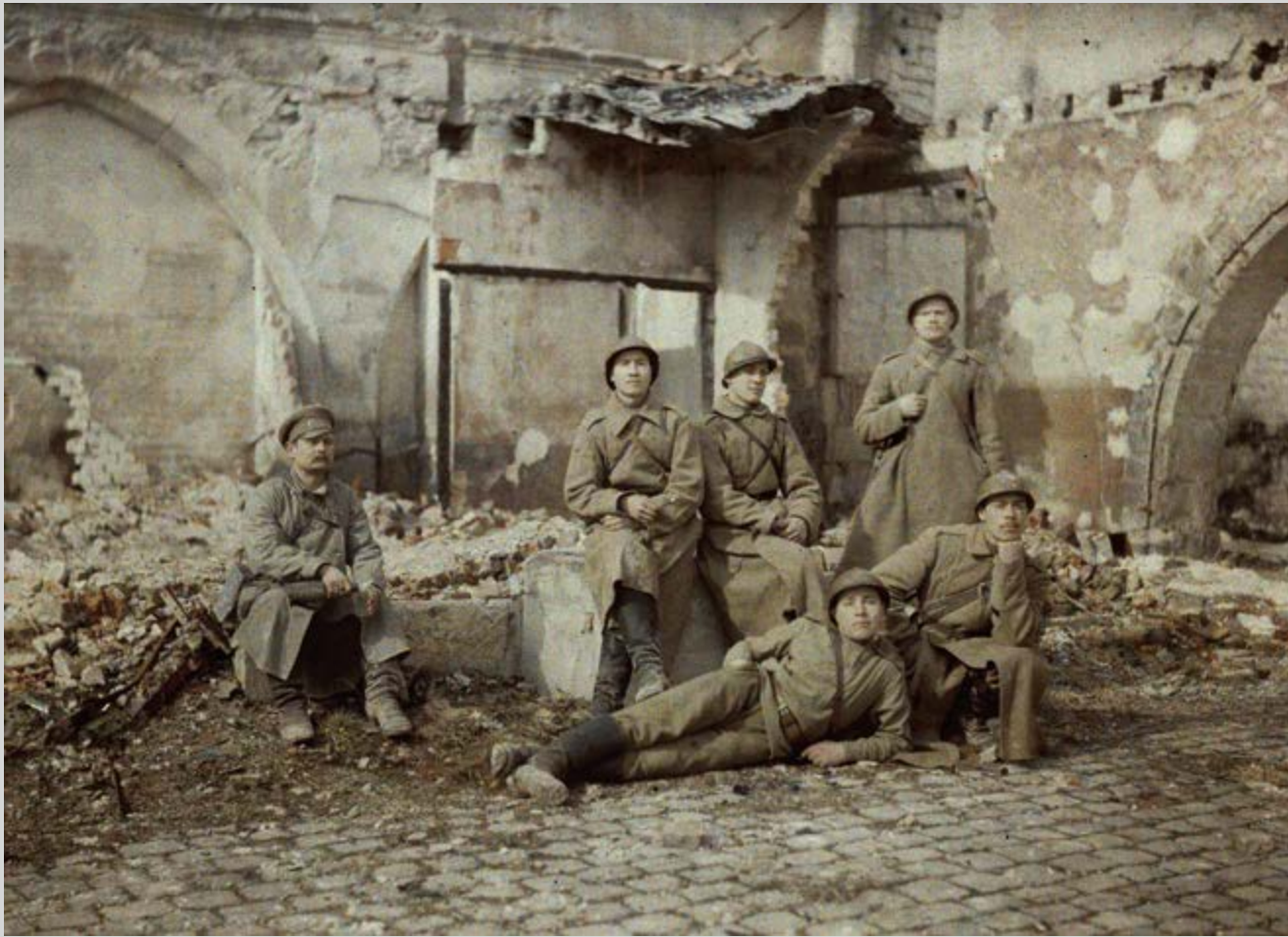
Fernand Cuville, Russian Soldiers at the Convent of Les Cordeliers , 1917, inkjet reproduction of original autochrome, 9 x 12 cm, Médiathèque de l'Architecture et du Patrimoine, Montigny-le-Bretonneux. CVL00046, © Ministère de la Culture / Médiathèque du Patrimoine, Dist. RMN-Grand Palais / Art Resource, NY

of truth-telling: they cannot adequately capture the enormity of the events in question, and yet, in its aftermath, they serve as vital evidence to piece together what transpired. They signal events but they cannot contain them, however strong the desire for such closure. Photographs are encapsulations – moments that are selected, framed, and lifted out of time and space. They exist both in history and out of history and serve as much as evidence as invention. They occupy a curious terrain of permanent present – and yet, by virtue of their content, they offer the viewer a glimpse into something that once was. As visual arguments, they propose a point of view that requires a willing viewer who understands their signs and symbols. As aesthetic objects, they command a presence in their own right, while simultaneously serving as traces of action that transpired in the past.