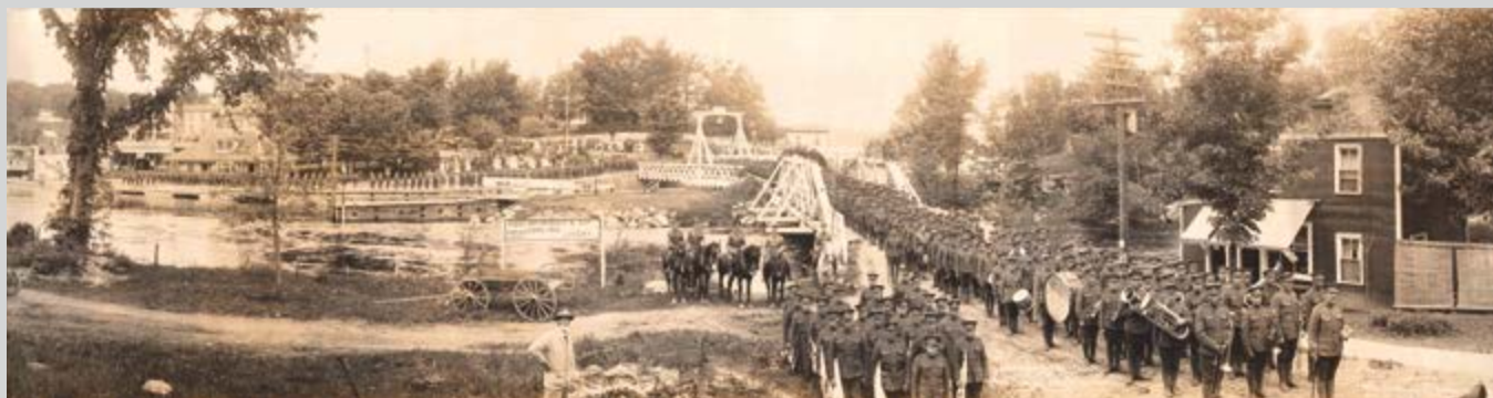
122nd Overseas Battalion, C.E.F. – Port Carling, Muskoka, Ontario, 1914–18, gelatin silver print, 24 x 90 cm, George Metcalf Archival Collection, Canadian War Museum, Ottawa