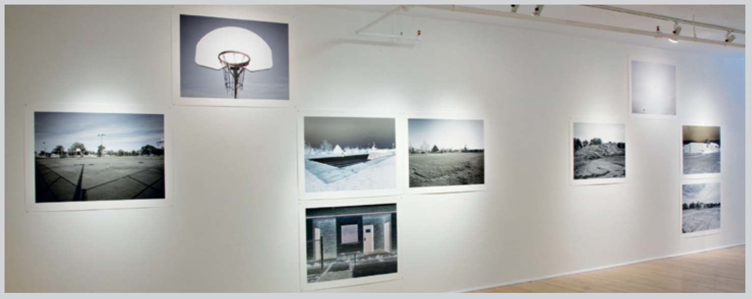
Polyptyque - Sans titre (piscine des officiers); Polyptyque - Sans titre (canex, caisse populaire, barbier Yvon, etc.), 2017, five and four inkjet prints, 89 × 114 cm ea.

In this photographic essay, Sylvie Readman brilliantly addresses the strange topography of the abandoned military base at Saint-Hubert, Quebec, in terms of non-place and liminal space. Her fortuitous discovery of this site has resulted in some of her most memorable images to date.