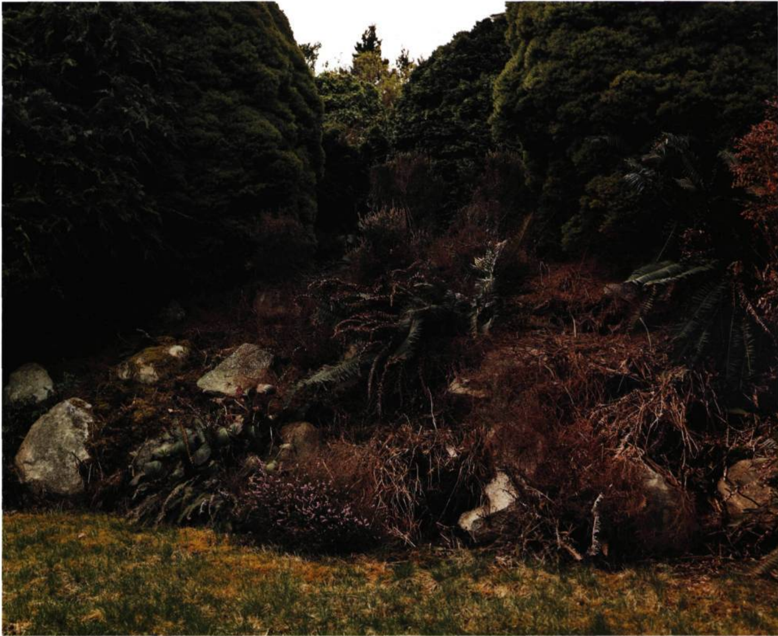
Border Study; Polystichum Munitum , Calluna Vulgaris , Picea Glauca Var, Albertina "Conica" colour print 76 x 96cm 1999