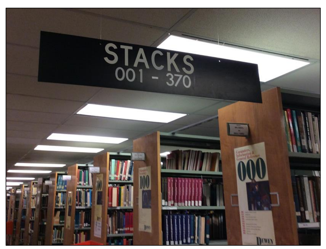
Figure 2 Participant 7's photo showing a sign for the stacks at the OISE Library.

participant explained that the combination of natural light and electrical outlets made this place "prime real estate." The photo also led to a long discussion about the use of library spaces for events, the importance of quiet study spaces, and the sense of ownership students feel for their favourite library places. I hope the second phase of analysis will reveal more examples like this and open the door to potential new research questions regarding the student culture in library spaces.