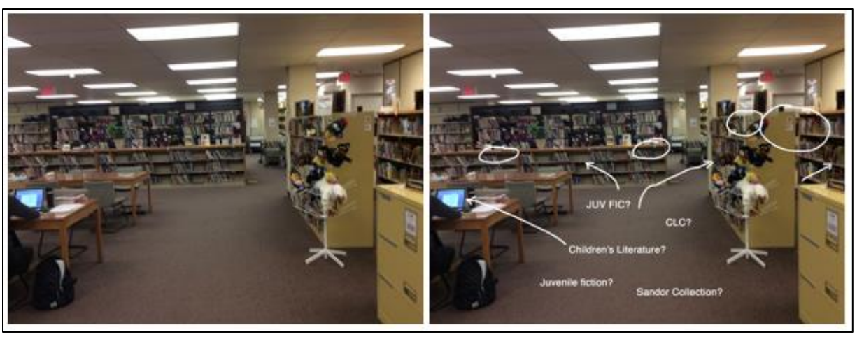
Figure 1 Participant 6's photo of the Children's Literature Collection in the OISE Library, and the same photo as annotated by the researcher after the interview.

Collection area. Ultimately, she said, "I just wasn't sure what to trust" (Participant 6).