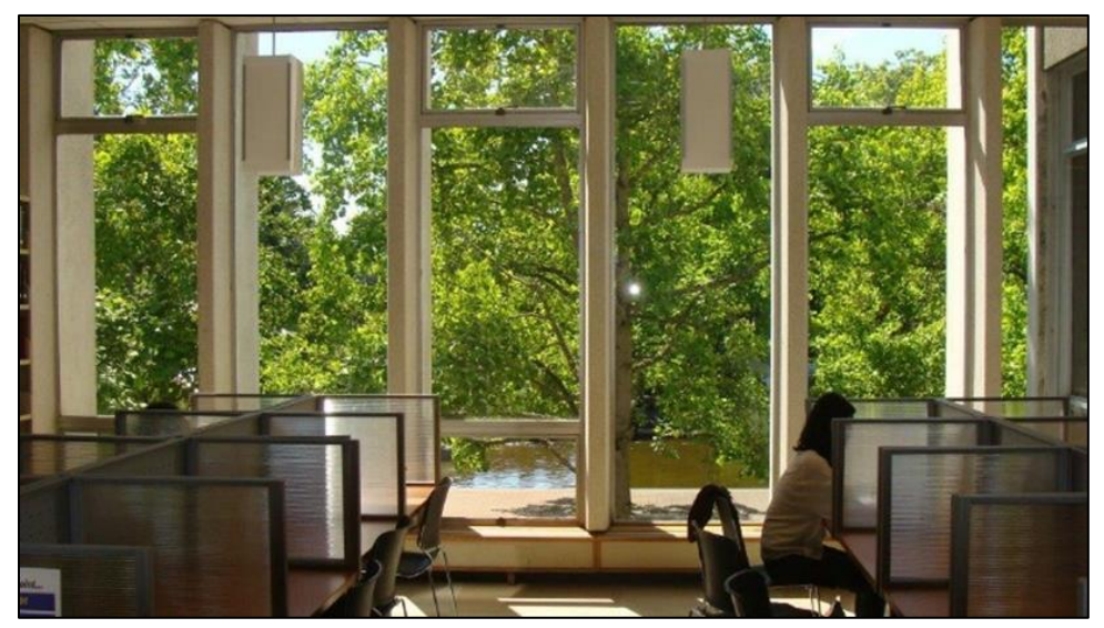
Figure 4 Participant's photo of natural light at UVic McPherson Library.