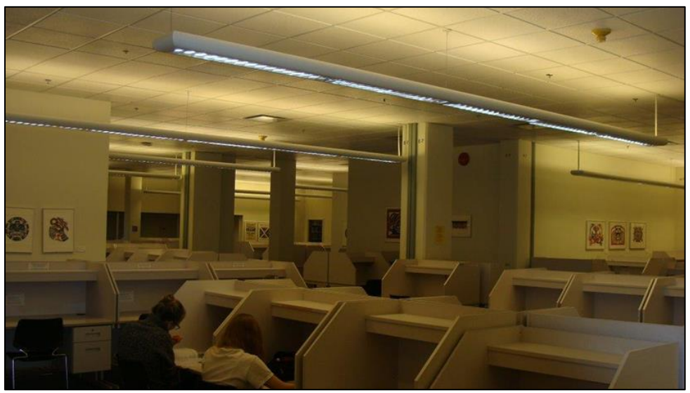
Figure 5 Participant's photo of a dark corner of UVic McPherson Library.

Yet there were also many photos of areas in the library that are dark and ominous (see Figure 5).