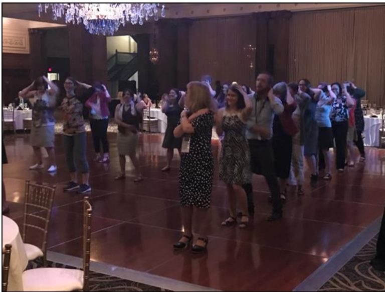
Figure 3 Line dancing at the conference gala dinner at the historic Crystal Tea Room!

The afternoon before the conference began, preconference attendees opted to attend one of the workshops on developing EBLIP skills, centred in archives and special collections libraries, engaging assessment to show value and make decisions, or learning tips to publish