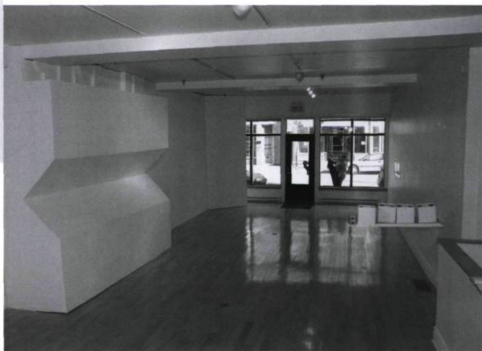
Matthieu HUSSER, Déplacement cartographique , 2007. Vue d'ensemble de l'exposition.

Husser utilise ses maquettes comme un miroir «reformant», visant à réparer les déformations