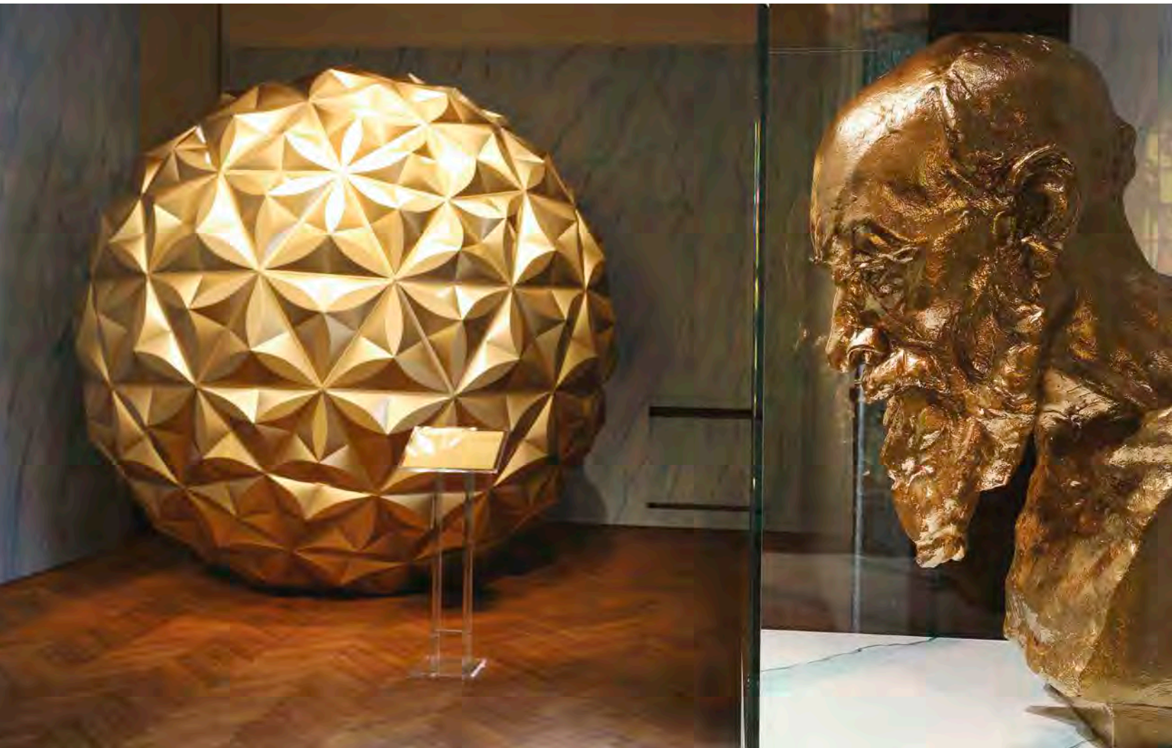
Arseny Zhilyaev, Cradle of Humankind , 2015. Installation detail, mixed media. Courtesy of the artist and V-A-C Foundation. Photo: Alex Maguire.

[...and] only art can save man from this denigration” 5 because art is an envisagement, not a thing, it is “a revelation of the way we use things.” 6 In this paradigm, Nikolai Fedorov envisions a cosmical reconfiguration of a future society as an art museum in which the government will act as an art curator and the citizens will be artworks, contemplated as objects of revelation.