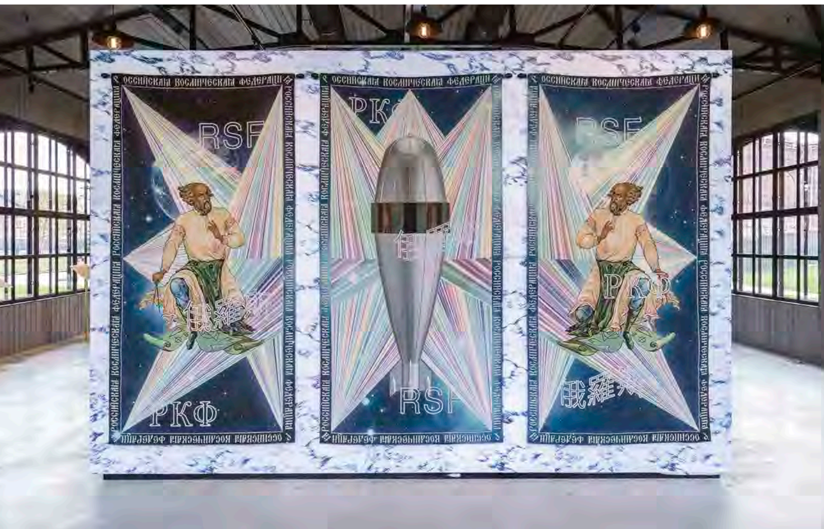
Arseny Zhilyaev, Tsiolkovsky, Second Advents, 2016. Mixed media. Gazprombank Collection.