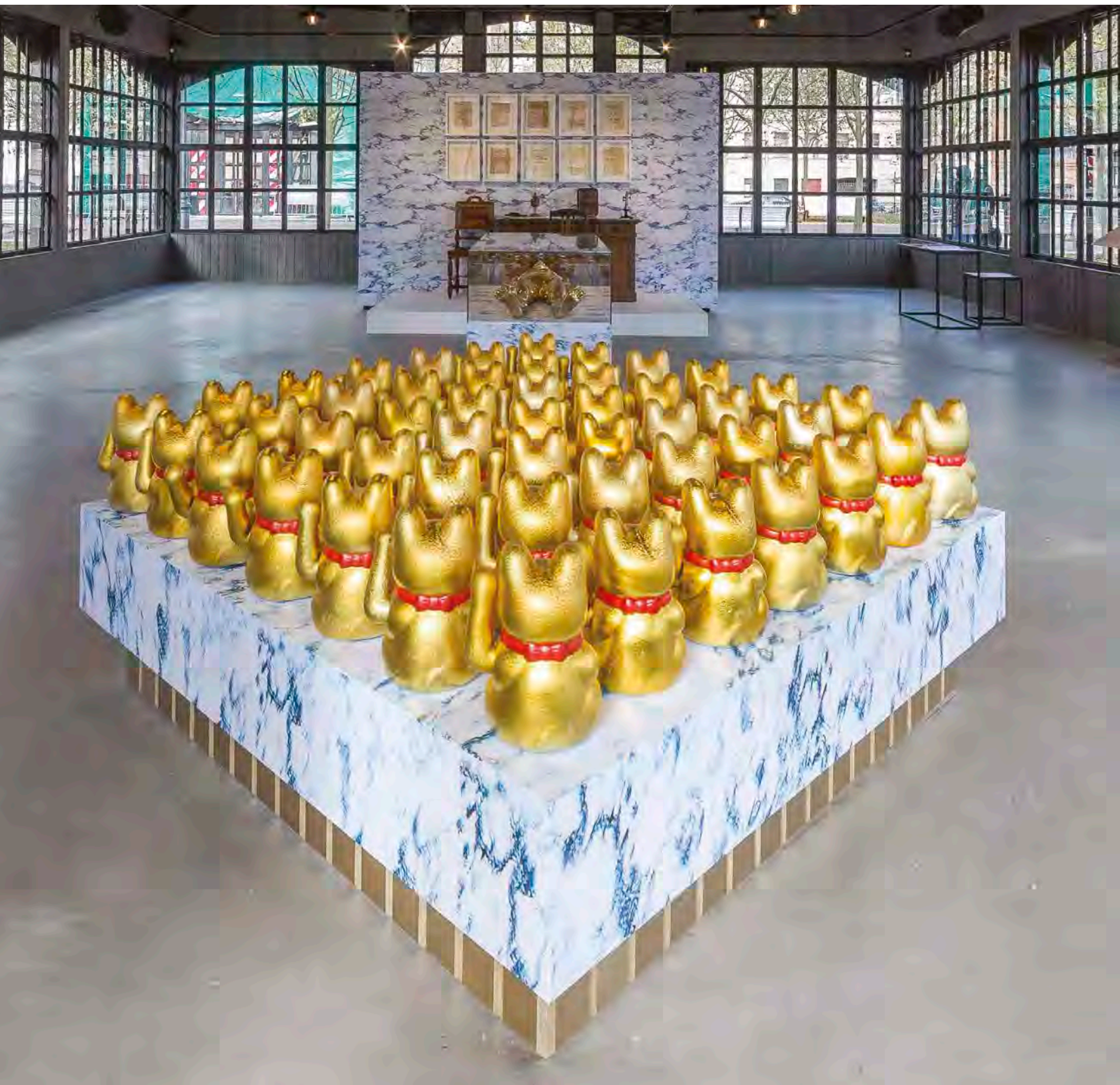
Arseny Zhilyaev , Tsiolkovsky, Second Advents , 2016. Mixed media. Gazprombank Collection.