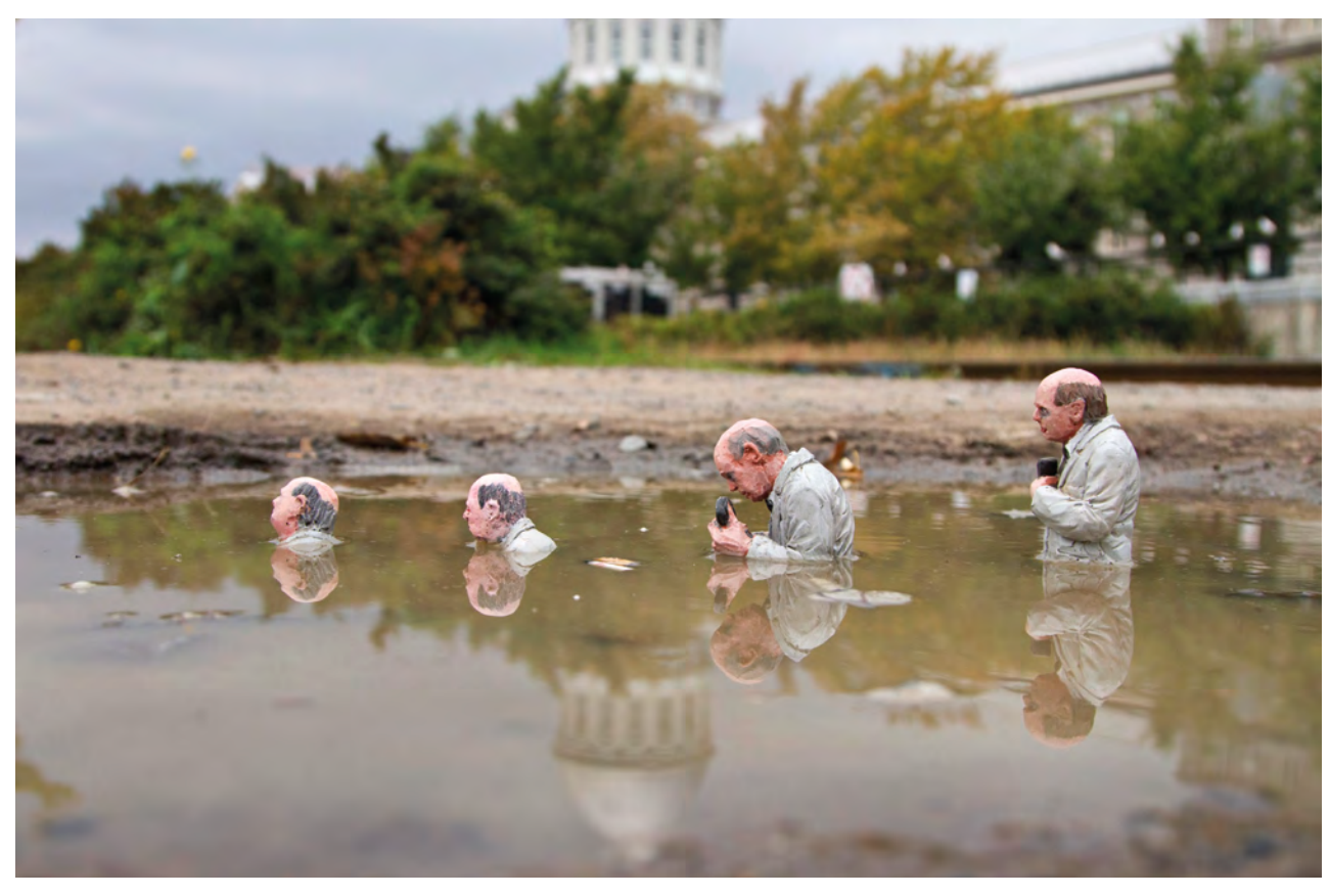
Isaac Cordal, Follow the Leaders, 2015. Installation view, Montréal.