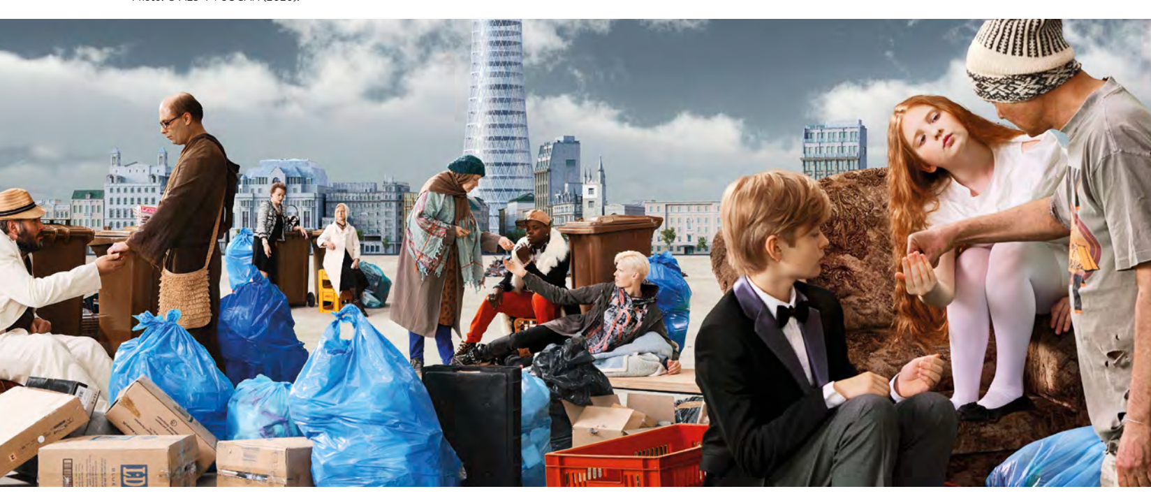
AES+F, Inverso Mundus, 2015. Still from the HD video installation, 38 min. Courtesy of the artists. Photo: © AES+F / SOCAN (2020).