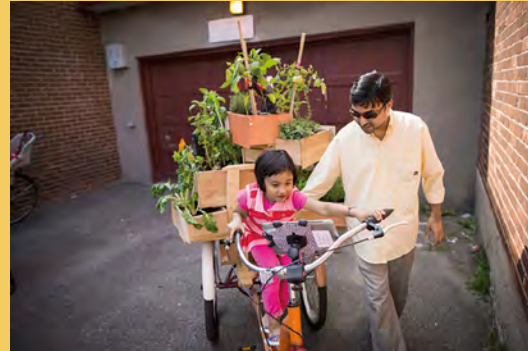
SenseLab, Three Mile Meal, Montréal, 2013.