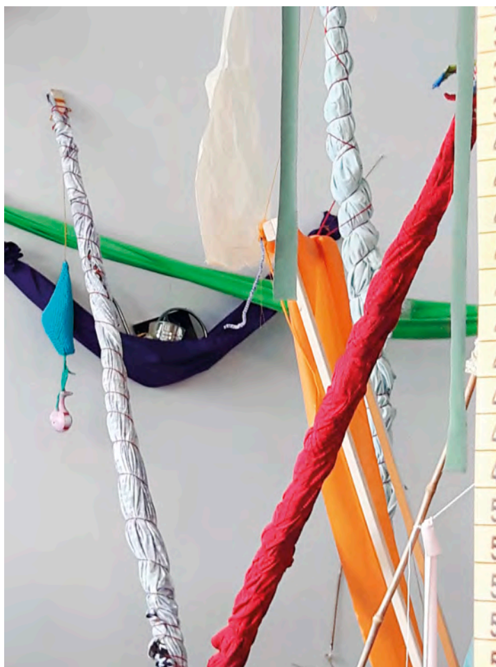
SenseLab, SpaZe, Concordia University, 2019-2020.

And just as easily as they arrived, they might never enter again. The thing about SenseLab is that it's not about "growing" something so that it scales up. It's about exploring what happens in the