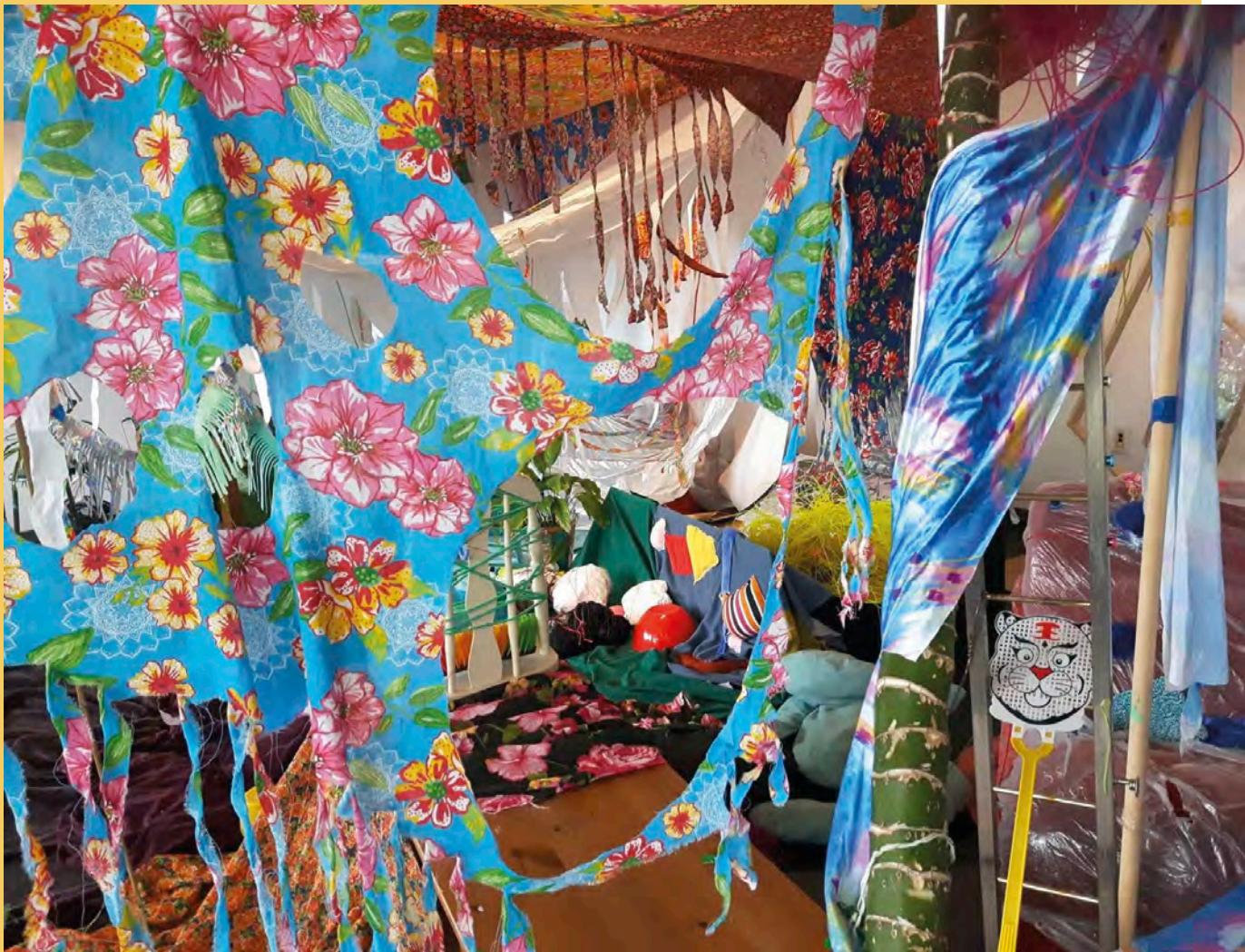
SenseLab, SpaZe, Concordia University, 2019-2020.