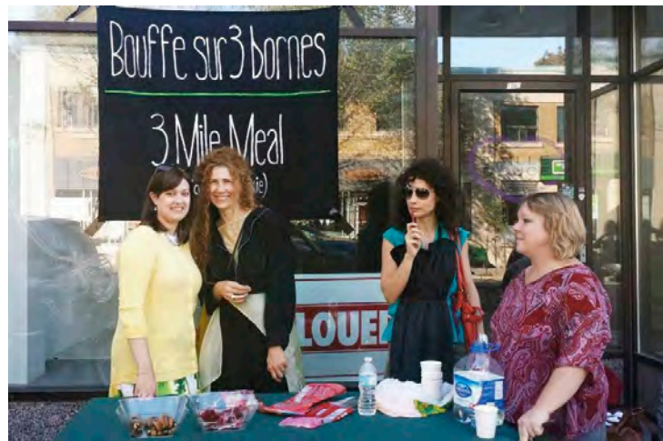
SenseLab, Three Mile Meal , Montreal, 2013.

Through the practice of composing, it became possible to do a version of the work we had learned to do with philosophy: we could collectively attune to the material/incorporeal environment and move with it. Mostly this occurred without language. The composing is not about a negotiation that is spoken. It is about listening to the materials themselves, attending to angles of light, working with sound (and the ubiquitous, quite dreadful university fans that blanket the space with their incessant hum). Working across a range of everyday materials (fabric, string, paper, rocks, furniture, etc.) and the more incorporeal effects of light and sound and sense, hours upon hours would be spent crafting material/spatial/architectural encounters by making space .