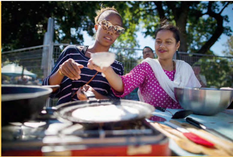
SenseLab , Three Mile Meal , Montréal, 2013.