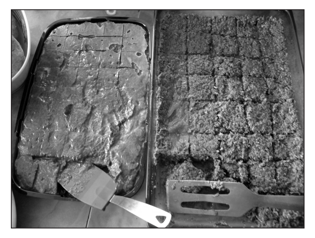
Figure 11. Sweet and savory bars of tundra greens, Gambell, Alaska, Photo by Sveta Yamin-Pasternak, 2011.

specificities in the Alaska-based methods of making plant foods have also been duly noted by some Chukotkan chefs. One of these methods is making the sweet and savory dishes made with tundra greens denser than the consistency of a customary Chukotkan mash and serve them in a baking dish, cut into squares. To a North American eater, such execution will likely resemble a common way of serving various savory and sweet dishes, such as a portioned-out lasagna or brownie bars (Fig. 11).