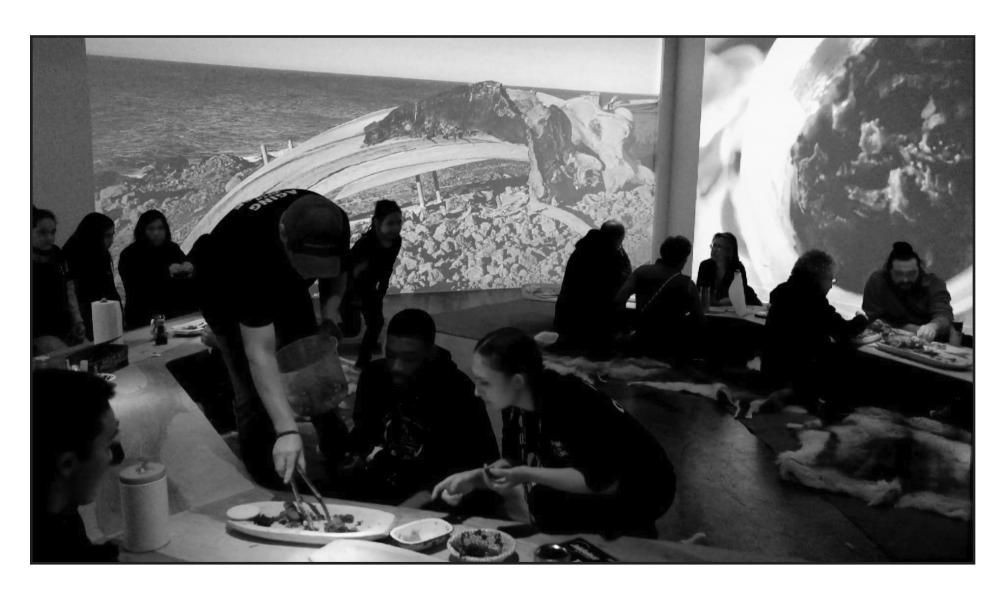
Figure 2. Exhibition of Aging with Change: Food Arts in the Bering Strait , presented at the 2018 Alaska Festival of Native Arts, University of Alaska Fairbanks Fine Arts Gallery. Photo by Sveta Yamin-Pasternak, 2018.