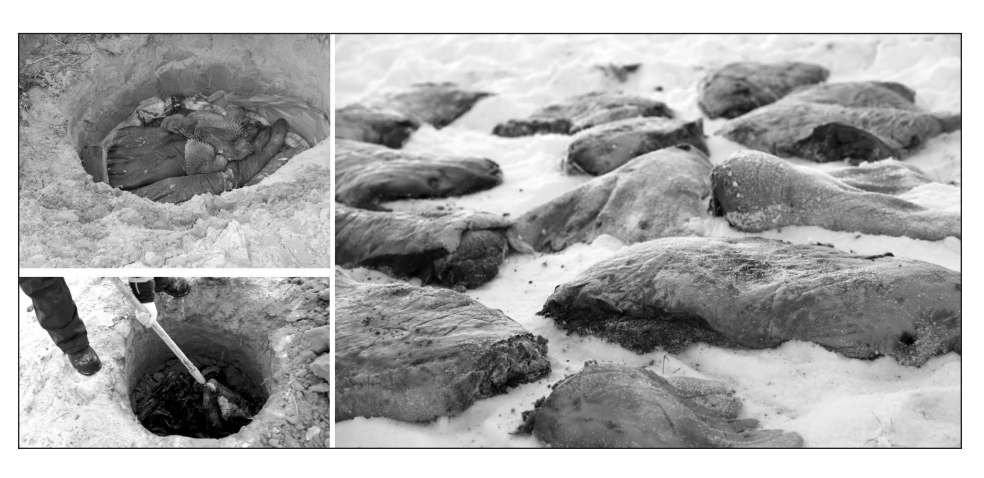
Figure 6. Walrus at the start and end of the May-December fermentation process, Shishmaref, Alaska.

Walrus products prepared using this method are consumed throughout the region, but the shape of the pit and the product is different in every village. In Shishmaref, the method is to layer large pieces of blubber and meat, cut into rectangular shapes. The bottom layer is placed with the skin facing the ground, opposite of the top layer, while the flippers, liver, heart, and other parts are sandwiched in between. A common type of a meat hole in this village is shallow and has to be dug anew for each use (few households have cellars built for long-term use adjacent to their residence). Clusters of this type of meat holes are found in communal areas of the village and are used for the processing of animal products used for food, hides, and tools and various other objects. The physical terrain around the village is relatively flat and the soils are sandy and clayish. After the pit is dug, the floor and sides are covered with cardboard, the meat is deposited, another layer of cardboard is placed on the top, and the hole is covered. We once participated in this process during the month of May, and we returned to Shishmaref in December of the same year to take part in the extraction process. The latter involved chiseling through the frozen ground, hooking the meat with long retriever poles and immediately peeling the skin off each piece while it was still soft, having just been taken out of the ground (Fig. 6).