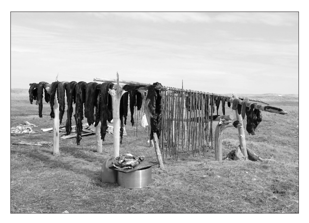
Figure 3. Drying rack in Shishmaref, Alaska, filled with parts of a freshly butchered bearded seal.