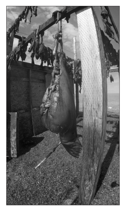
Figure 4. Walrus roulade made in Gambell, Alaska. Photo by Igor Pasternak and Sveta Yamin-Pasternak, 2017.

It is relevant to emphasize that many Yupik, Inupiaq, and Chukchi explicitly refer to the culinary creations they make and/or consume as art, and point out the importance of the formal elements (color, texture, shape, etc.) while arranging the ingredients, serving, and eating. At the same time, it should be noted that Russian and English are used as our principal means of communication during our fieldwork, and that our research is being conducted in a time when both Chukotka and Alaska provide abundant access to televised cooking shows and other programming known colloquially as food porn (where food and food-related activity are presented in intentionally glamorized, visually enthralling ways). The idea of a chef as an artist is not uncommon to that context and we have not examined whether that may be an influence. Finally, it is imperative that we remember the seminal statement by Jeremy Coote that "the anthropological study of visual aesthetics has been hampered by an undue concentration on art and art objects" (1994, 245). Coote calls on researchers to be open to the everyday visual experiences