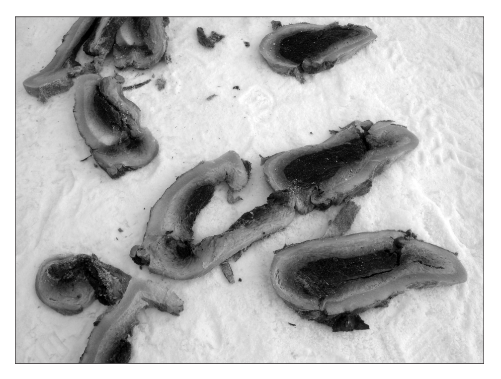
Figure 9. Slices of a freshly extracted aged walrus roulade, ready to eat, Savoonga, Alaska. Photo by Sveta Yamin-Pasternak, 2011.

increasingly common over the years of our fieldwork in the Bering Strait. Certain products are consumed almost immediately upon extraction from their drying or fermenting environments. Some recipes also involve subsequent boiling or stewing, often in combination with other ingredients. When the fermented walrus described above is taken out of the cellar, it is sliced into steak-like pieces that include layers of meat and blubber; this step can be done on the snow directly next to the pit (Fig. 9). At mealtime, it is cut into bite-size pieces and, as is widely prescribed by the etiquette of consuming most local foods, is eaten using one's fingers.