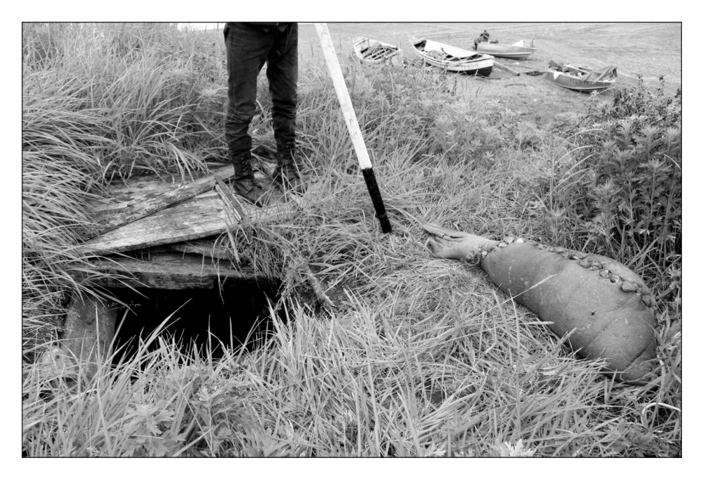
Figure 7. Meat hole and walrus roulade at the start of the fermentation process, Sireniki, Chukotka. Photo by Sveta Yamin-Pasternak and Igor Pasternak, 2015.

freestanding outdoor structures, appendages mounted to the outer house walls, and indoor fixtures like a wooden bar suspended from the ceiling—are an essential part of the foodway infrastructure in many Bering Strait homes. Indoor drying racks are typically used for quicker projects, for example when frozen meat is thawed, sliced, and hung to make jerky; here, proper ventilation is a critical factor. Outdoor racks are a complex construction, often made of driftwood, with each log selected and positioned to serve a particular purpose. One section may be designated to hold the garlands of guts that have been turned inside out and rinsed prior to drying. Another section may be built to accommodate the heavy pieces of meat suspended or laid horizontally on top of a log, allowing space to maneuver between the different cuts when the maker needs to cut thicker pieces into scraps, scrape the fat bits off certain sections, or periodically flip over each piece to ensure a balanced exposure to sun and wind (Fig. 3).