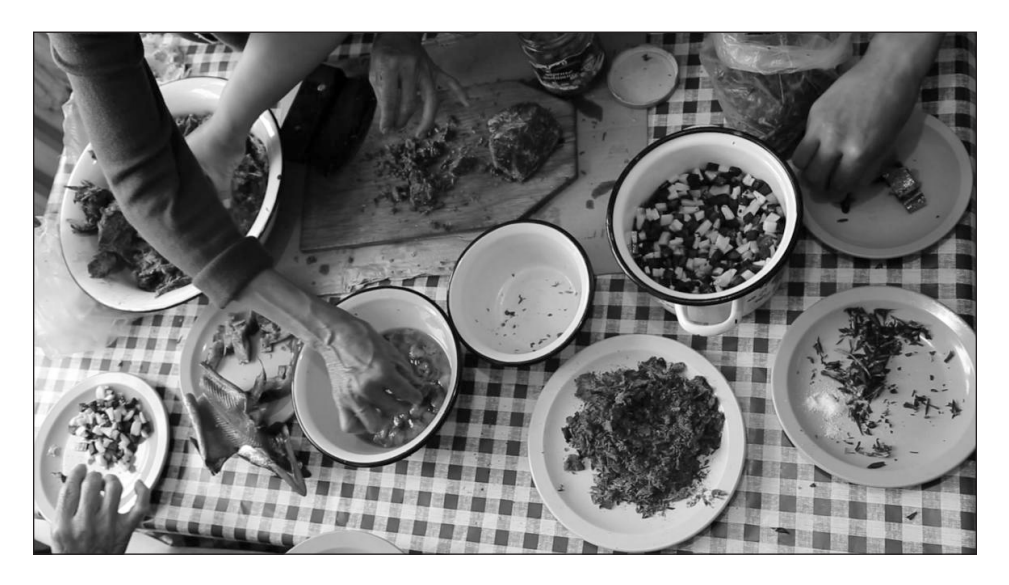
Figure 10. Feasting in Enmelen, Chukotka. Photo by Igor Pasternak, 2015.

a savory green mash made of sourdock, with the addition of leaves of willow ( Salix arctica ) and Rhodiola rosea (functioning as a dipping condiment in the course of the meal), and an assortment of frozen ascidians that people had collected along the beach. Feeding a total of nine people aged 8 to 72, the entire procedure of commensality involved each participant ingesting a variety of plant-meat, gooey-crunchy, sweet-savory-sour, hot-frozen bite-size combos, all assembled and eaten using our fingers (Fig. 10). Meals having a less elaborate menu employ a similar eating etiquette, with fewer types of combinations (Jolles 2002; Starks 2011, 2007), echoing the prominent ruminations in food scholarship on the workings of the flavor principle (Rozin 1983) and notion of the proper meal (Douglas 1972).