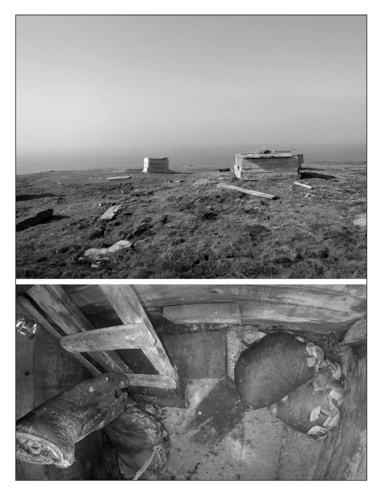
Figure 8. Outside and inside of a meat hole in Savoonga, Alaska, with two walrus roulades and a flipper hung separately, all at the start of the fermentation process. Photo by Sveta Yamin-Pasternak and Igor Pasternak, 2016.

buckets or barrels, where they are stirred daily while the blubber renders into oil. Oil of marine mammals, considered essential for most meals, is used as both an ingredient and a condiment (Lantis 1984). Like the subterranean spaces used for fermentation and storage, drying racks are architecturally designed with consideration for the local terrain, as well as for the culinary traditions of individual families. During intensive harvesting seasons, tending the meat rack is a daily and laborious task, performed predominantly by women.