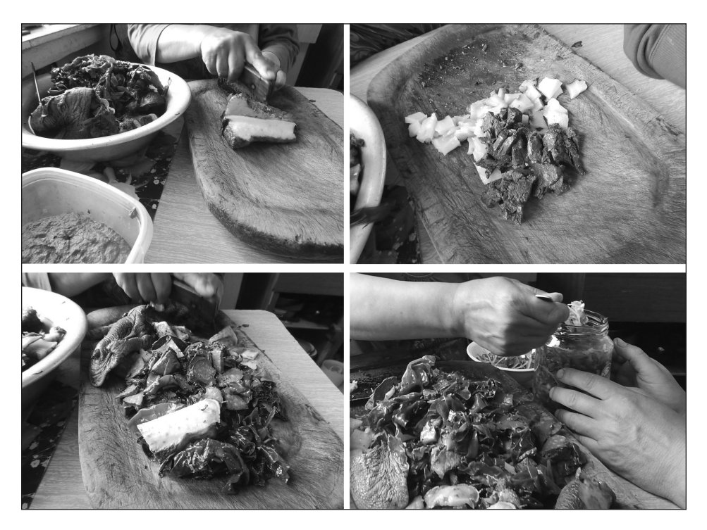
Figure 5. Communal meal platter served in Enmelen, Chukotka. Photo by Igor Pasternak and Sveta Yamin-Pasternak, 2015.

"which we all, not just the artists and art critics amongst us, experience and delight in" (ibid.).