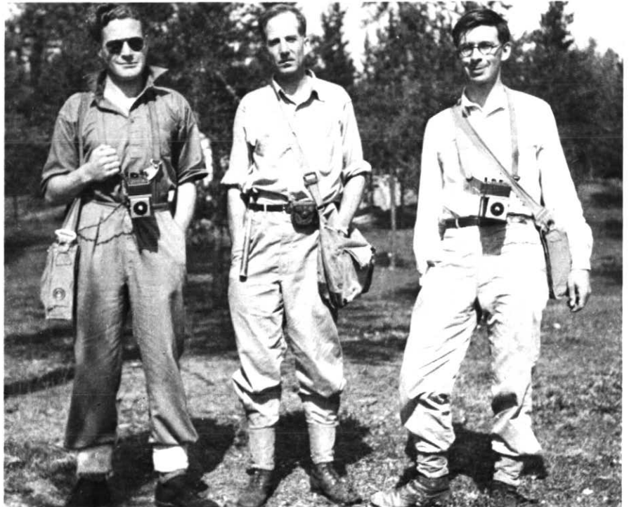
Figure 1 The first Scintillometer Surveys— June 1949, Nisto Property, Black Lake, Athabaska Area. Two Mark II spectrometers with ratemeters and controls suspended in front and separated

The initial attempt to measure radioactivity from aircraft was made on first approaching the Nicholson mine on June 18, 1949. Before landing, the pilot was instructed to fly over the main vein and in doing so a significant increase in radioactivity was noted with the instruments. A day