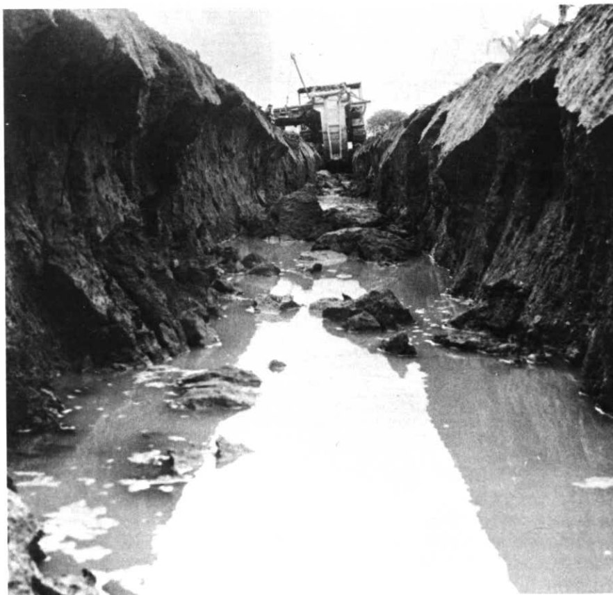
Figure 1 A pipeline excavation illustrating severe side calving.

A typical soil profile is broken into a series of horizons (A,B,C)