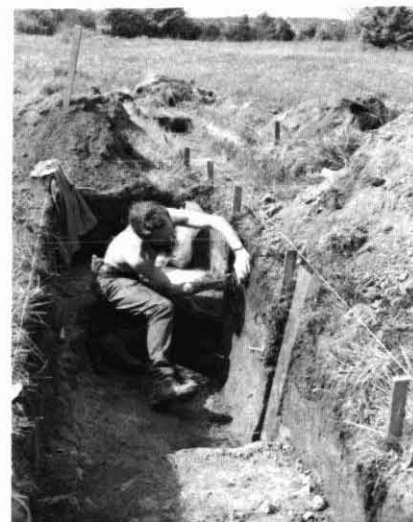
Figure 1 Soil sampling at an archeological site

The preservation of the remains of physical structure in the ground such as post holes, pits, and hearths, together with the artifactual material within soils, undoubtedly facilitates archeological interpretation, but perhaps even more important is the fact that the soils presently covering archeological sites also contain a chemical record of past human activities.