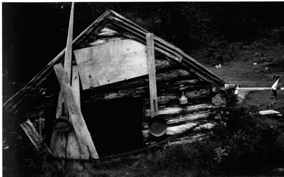
Figure 1 The old and the new: Tom MacKay's original cabin, from his early, mid-1900s prospecting programs in the Eskay Creek area, is in stark contrast to the modern, helicopter-supported program that discovered and developed the rich Eskay Creek deposit into one of the world's highest-grade gold and silver mines. Note the helicopter tail boom behind the cabin to the right. Photograph by R.G. Anderson, August 1991.

The 21 zone contains a number of subzones distinguished by varying mineralogy, textures, grades and metallurgical characteristics. Stratiform mineralization is hosted in marine mudstone at the contact between underlying rhyolite and overlying basalt packages. The 21A, 21B and NEX zones occur at this stratigraphic contact. The HW zone is located stratigraphically higher in the sequence, usually above the first basaltic sill. Stockwork vein and disseminated mineralization (including sphalerite \pm galena \pm pyrite \pm tetrahedrite \pm native gold) are present in the 109, 21C and Pumphouse zones. The 21 zone contains the bulk of the ore and consists of clastic sulphide-sulphosalt beds, including sphalerite, tetrahedrite-freibergite, boulangerite, jamesonite, stibnite, galena, pyrite, electrum and amalgam (Fig 2). Sedimentary facies variations are well preserved locally, although commonly overprinted by later sulphosalts and locally stibnite \pm rare