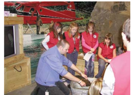
Figure 9. Panning for gold at a 'mineral exploration camp'.

Public Lectures are a free and regular feature at the GEO CENTRE, and those presented to commemorate the International Year of Planet Earth (IYPE) have been especially well attended (speakers have come from the St. John's geoscience community, the Geological Survey of Canada, and even internationally, e.g. Dr. Robert Ballard, scientist emeritus, Woods Hole Oceanographic Institute). The general public and students are also invited to a series of Special Events hosted by GEO throughout the year. These include Earth Day celebrations (featuring, for example, 'Stump a Geologist', 'Panning for Gold' (Fig. 9), and solar observations guided by members of the St. John's chapter of the Royal Astronomical Society of Canada); a bridge-building competition sponsored by National Engineering and Geoscience Week; and 'Doors Open St. John's', an event during which the GEO CENTRE and other museums and institutions in the city offer a free exploration of exhibits and facilities. Finally, GEO renews interest in its mission and complements its permanent galleries by hosting Travelling Exhibits , mostly during the off season. These are displayed in the Celestial Gallery, new space developed at the entry level and leading off the main entrance. Some of these temporary exhibits have enjoyed corporate sponsorship and helped generate valuable media interest. Exhibits hosted to date include: Dinosaurs and Company, From Crystals to Gems, and Arctic Adventure.