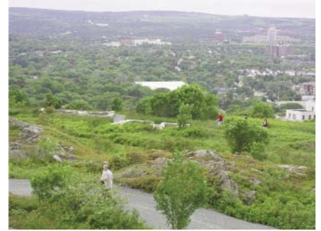
Figure 8. GEO PARK overlooks the city of St. John's. In the foreground are some of the PARK's trails, outcrops and stoneworks.