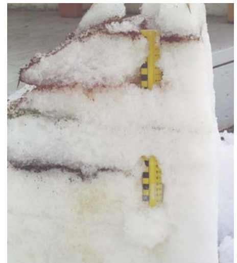
Figure 2. Snow bank with, from bottom to top, coffee, chives, chili and cinnamon layers.

ral snow banks and speculate on how these relate to specific events? A snow bank is an effective way to explain and illustrate stratigraphy and time; it presents an opportunity to run long or short, natural or artificial experiments. Figure 2 shows the snow bank I built behind my deck. At the end of each snowfall or load of snow, I spread a common colourful material over the surface: I used ground coffee and cinnamon, dried chives and chili powder. I recorded the date and time each powder layer was deposited. At the end of the experiment I cut a core into the snow bank, and then cut the snow bank in half. In both the core and the