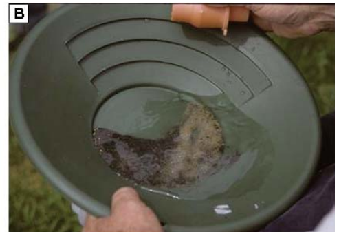
Figure 6. A. The author explains to a group of planners and environmentalists how to pan gold. B. A typical pan with lots of magnetite, garnet and quartz and anywhere from 10 to 125 flakes of gold.

as a by-product of the gravel mining operations just northwest of Edmonton. Every spring flood brings a new layer of flour gold and amateur prospectors and recreational gold panners always strike it rich.