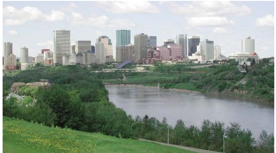
Figure 1. The obvious geological features of Edmonton are the North Saskatchewan River (gold, landslides, outcrop) and the buildings (building stones from around the world).

Some geologists are reluctant to lead a fieldtrip or workshop because it may cover topics they have not studied since they were at university. Over my thirty years of public lectures, workshops and fieldtrips, questions were posed that I could not answer, but in only one instance did a participant know much more about the topic. He was a grade three student in my son's class whose granddad operated a rhodochrosite quarry. This eight year-old expert kindly described the mineral for us and presented me with a polished specimen that I have to this day. I have had the pleasure of receiving assistance from professional experts in paleontology, mineralogy, structural geology and stratigraphy on some of my fieldtrips. Although it was reassuring for me to know that the information delivered was accurate and cutting edge, I sometimes found myself acting as translator between the specialist and the group. As leader, I had formed a bond with many of the participants that depended more on my ability to communicate at an appropriate level than on my qualifications. It was also apparent that participants were more often inspired through observation and activity than by a lecture; for example, I knew that they really recognized gold flakes or saw a pattern take form as a fossil when their faces would break