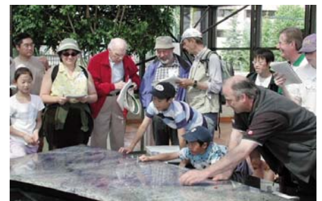
Figure 5. A mixed group of teachers, geologists and children slide magnets across this polished rock slab to find the blebs of magnetite. Sodalite gives the rock a blue colour.

Indiana Limestone that even some geologists assume, at first glance, to be artificial. Indiana Limestone is the stone used for the carvings we see in a number of downtown Edmonton buildings.