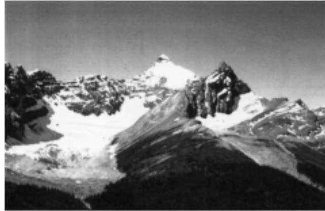
FIGURE 1. View west toward Hilda Glacier on the left and Mount Athabasca in the background, July 1981. The study site is located immediately to the left of where Hilda Creek emerges from beneath the distal sediment apron and traverses the local treeline in the left foreground. Shown in the right foreground is the "Hilda Rock Glacier" examined by Bajewsky (1988).

In a recent review Luckman (1998) illustrated the application of dendroglaciology to Little Ice Age glacier studies in the Canadian Rockies. We intend to show that dendroglaciological techniques may be equally suitable for describing the activity of selected rock glaciers over the same interval.