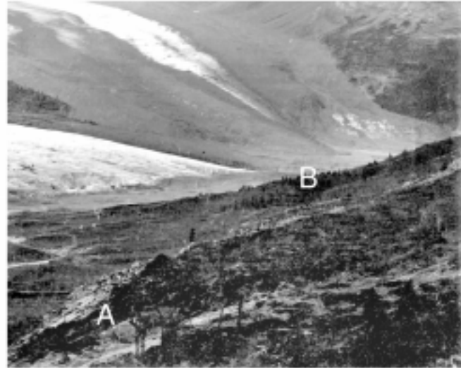
FIGURE 3. Athabasca and Dome Glaciers photographed from Sunwapta Pass in 1906 (right) and 1998 (left). This image is an enlargement of the lower right corner of Figure 2. The letters are explained in the text.

Les glaciers d'Athabasca et de Dome photographés à partir du col de Sunwapta en 1906 (à droite) et en 1998 (à gauche). Cette image est un agrandissement du coin inférieur gauche de la figure 2. On trouvera l'explication des lettres A et B dans le texte.