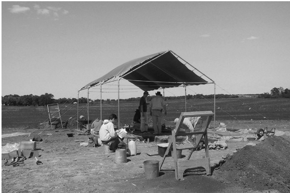
FIGURE 3. Fieldwork at the Lowton Site in the Tiger Hills.

L'équipe au travail au site Lowton, dans les Tiger Hills.