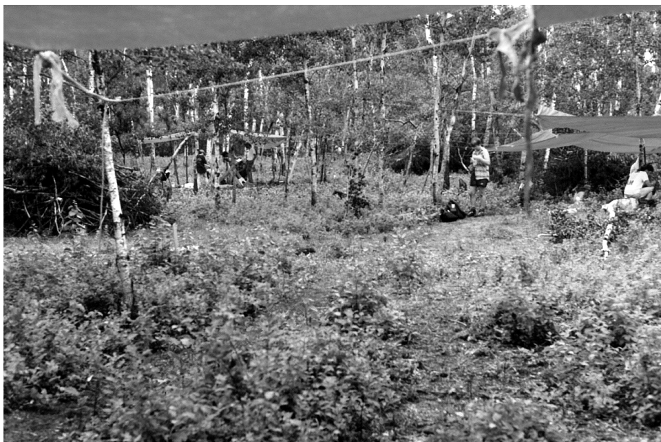
FIGURE 7. Aspen dominated forest section at the Vera Site in the Lauder Sandhills.

Partie de la forêt dominée par le peuplier au site Vera, dans les Lauder Sandhills.