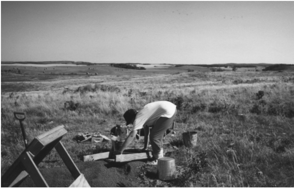
FIGURE 4. View across the parkland ecotone in the Tiger Hills.

Vue de l'écotone de la forêt-parc, dans les Tiger Hills.