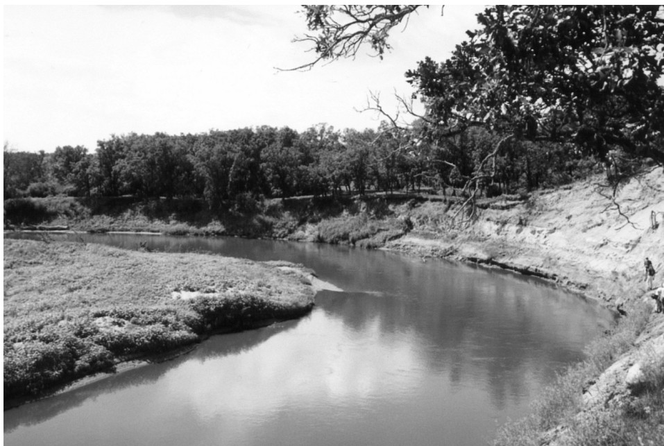
FIGURE 8. Souris River in the Lauder Sandhills.

La rivière Souris, dans les Lauder Sandhills.