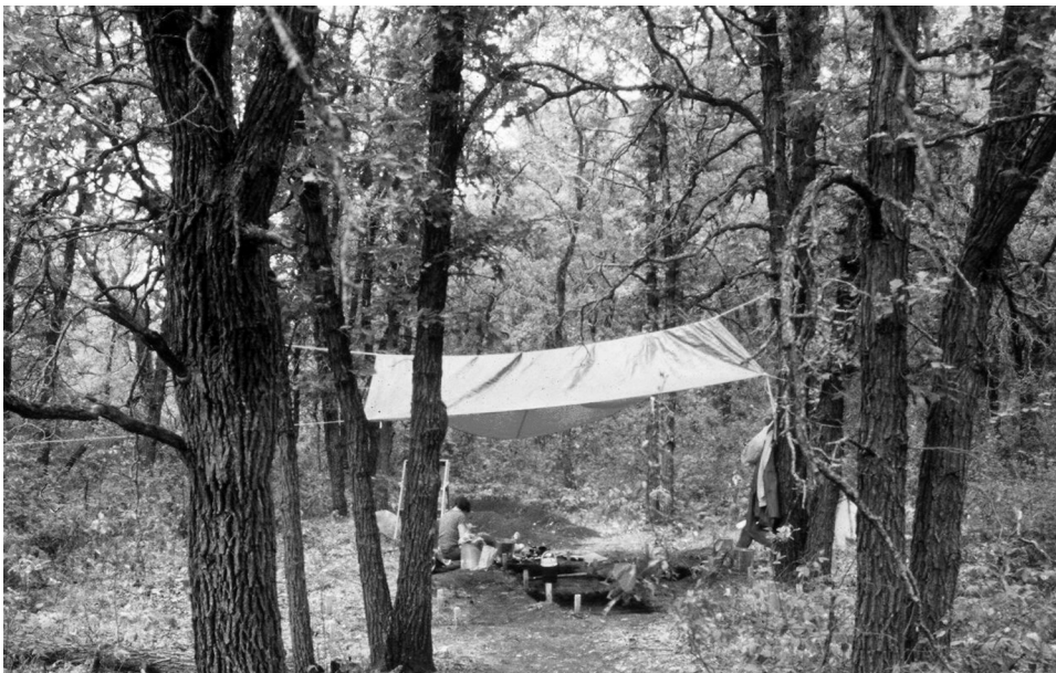
FIGURE 5. Oak dominated forest at the Lovstrom Site in the Tiger Hills.

Vue de l'écotone de la forêt-parc, dans les Tiger Hills.