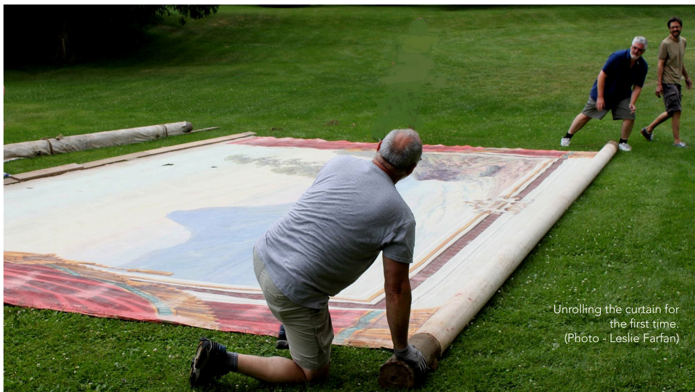
Unrolling the curtain for the first time.

After being measured and photographed by museum staff, the drape was carefully transported to the Colby-Curtis, where it is now stored in a proper climate-controlled environment, and where it begins a new chapter of its life. It is the hope of both the Haskell and the Stanstead Historical Society that a grant can be secured to have this magnificent piece professionally restored. Perhaps in the not-too-distant future, a suitable temporary venue can be found, where it can once again be enjoyed by all.