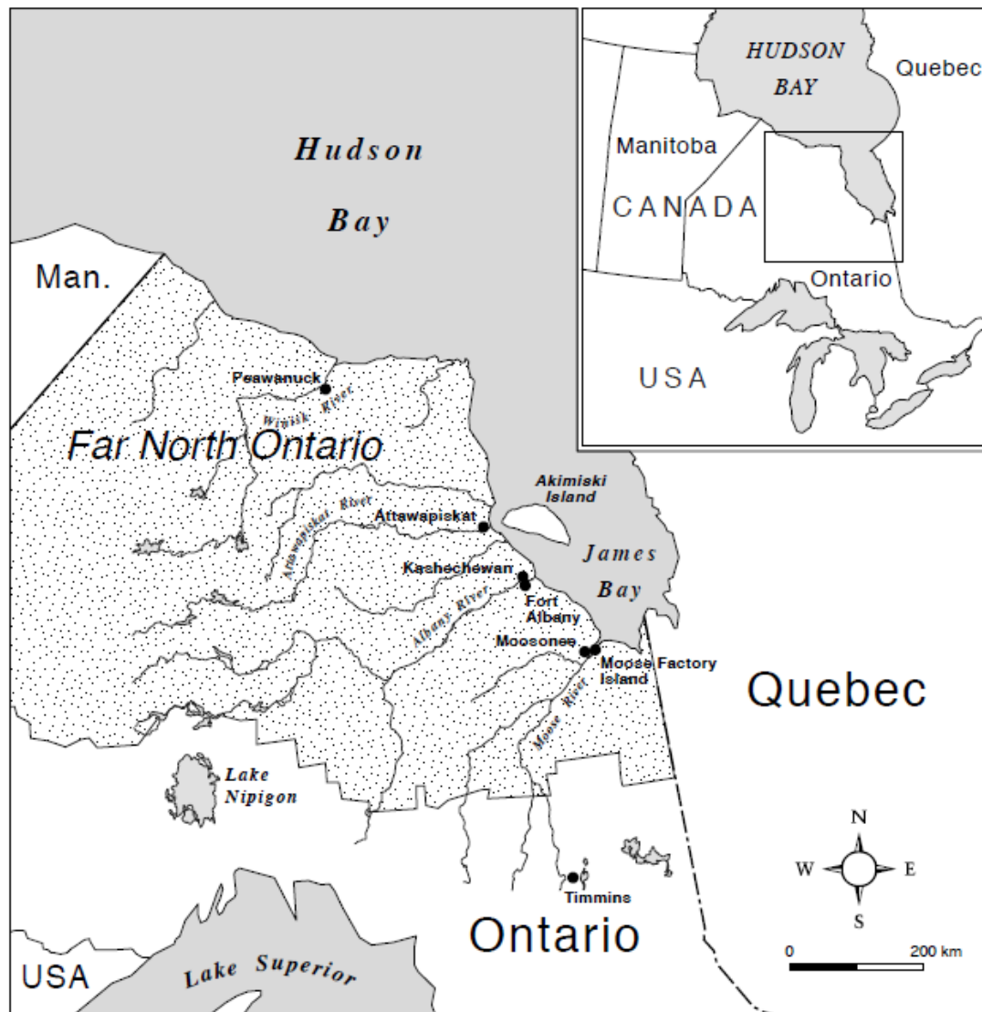
Figure 2. Ontario, Canada, and the Far North of Ontario (stippled area)