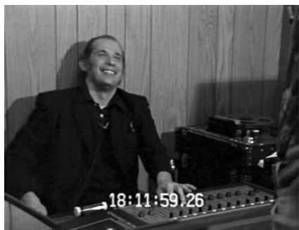
Figs. 7 & 8: Gould cuing the entry of one of the voices in The Idea of North (left); Gould at mixing desk still in conversation with John Thompson (right).