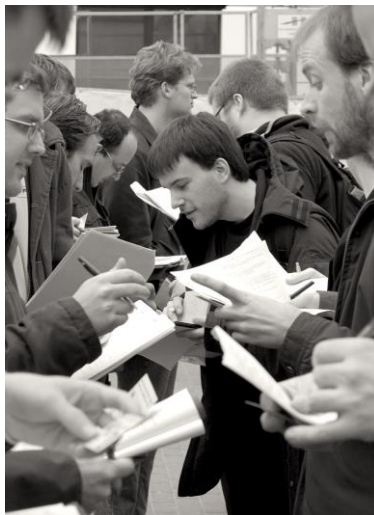
Fig. 6: Key signing party as FOSDEM 2008, Stevenfruitsmaak, Wikimedia Commons CC BY 2.5.

The ritual and affective dimensions of encryption are often overlooked in frameworks that emphasize its technical aspects. Among hackers, the signing of digital keys to communicate by email with PGP—an activity that confirms you are a trusted person within an encryption web of trust—has become a ritualized event. During hacker meetings, it is not rare to have “key signing parties” where all who want to attend will sign their public key face-to-face. Assembled in circles or in lines, participants (often white men) one by one recite out loud their public key—a long string of numbers—and thereby confirm that they are the ones behind their public key. In some cases, ID documents provide visual proof of identity. At this point, no digital media is involved: speech, pen, and paper are the sole accepted means of information transmission. It is through this process that members of an encryption network become fully trusted interlocutors since the authentication of their key was done face-to-face. This exercise can take a few hours depending on the number of participants. Once members have gone through this ritual, they become part of the web of the fully trusted.