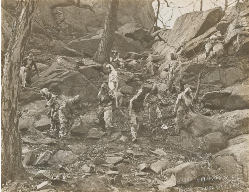
Fig. 2. Women's Camouflage Reserve Corps, of the National League for Women's Service, study camouflage at Van Cortlandt Park, New York, 2018.

tactics of concealment operate on the symbolic level is often detached from their actual technical efficiency.