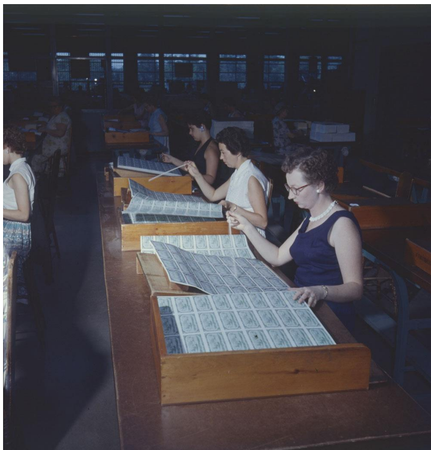
Fig. 2. Inspecting paper currency. Canadian Bank Note Company, Ottawa, Ontario, 1957.

Bureau of Engraving and Printing, verified that what was distributed as legitimate money was always printed correctly, visually checking paper bills before they went into circulation (see Fig. 2).