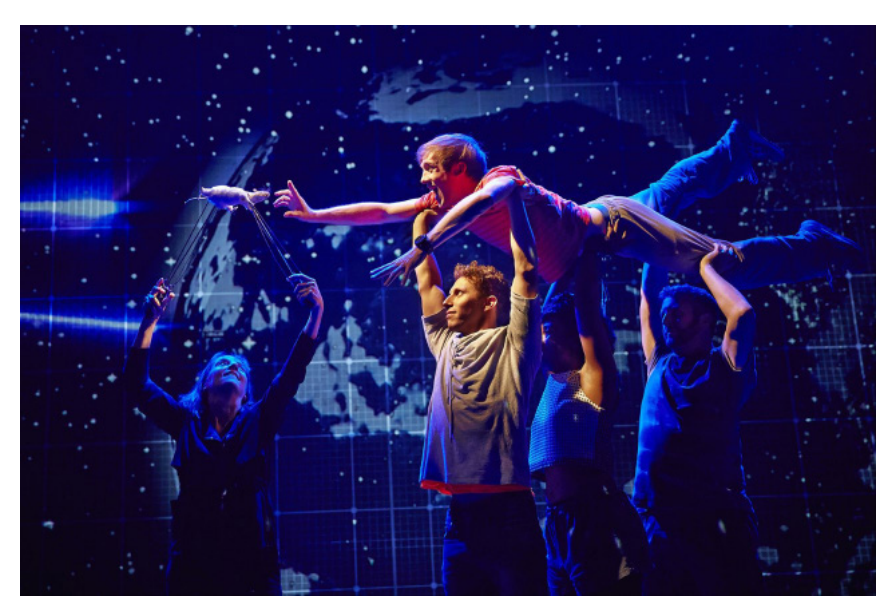
Fig. 1. An image from The Curious Incident of the Dog in the Night-Time ©Brinkhoff/ Moegenburg.

On stage, to figure a dream-like sequence, stagehands prop the body of the protagonist, Christopher Boone, in the air. The lights in the theatre dim drastically and, on the stage floor itself, dozens of small lights illuminate to represent a starred night sky. The same scene is captured for the screen in an aerial take, the limits of the camera lens aligning with those of the stage. As a result, the stagehands lifting