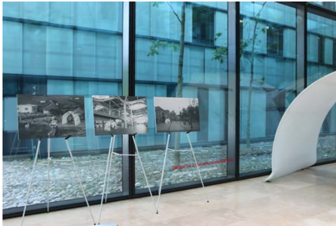
Figure 4: Display photographs of proposed D4DS usages, Design for a Dissemination Station , UNAIDS, Geneva, 2017. Portable tent structures with sound installation.

access (to good information, and, for many in the world, to vaccines themselves), and debating ideas regarding representation. In the latter regard, the pair asked broadly, “What do vaccines ‘look like’? How do we understand vaccines through various forms of visual representation, through the image culture that we are exposed to?” This led to research into biomimicry—the design of materials and structures modelled on biological entities and processes. At this point, they also began to discuss the degree to which, given the global context they hoped to deal with, their work should be committed to ideas of mobility—not only the mobility required to distribute information and vaccines themselves, but the realization that if art is going to offer meaningful impact in the context of vaccine discussions and realities, then the artwork itself would need to invoke forms of mobility through its propositional character and its structure.