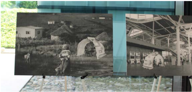
Figure 5: Display photographs of proposed D4DS usages (detail), Design for a Dissemination Station, UNAIDS, Geneva, 2017. Portable tent structures with sound installation.