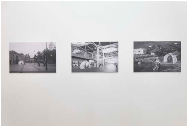
Annemarie Hou and Patrick Mahon, with Tegan Moore, Display photographs of proposed D4DS usages, Design for a Dissemination Station , Galleri KiT, Trondheim, 2017. Portable tent structures with sound installation.