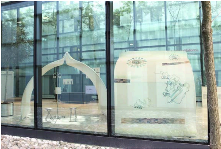
Figure 7: Installation view (from exterior courtyard), Design for a Dissemination Station , UNAIDS, Geneva, 2017. Portable tent structures with sound installation.